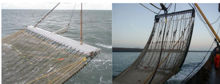
Figure 2 HFK Sum Wing with pulse trawl (left) and Delmeco trawl (right).

The gears used for pulse trawling (Figure 2) are originally based on beam trawling gear, but with substantially modified ground gear. The tickler chains are replaced with electrode arrays and in the case of the HFK Sum Wing with pulse trawl, the beam is replaced by a hydro-dynamic wing which is neutrally buoyant, with its position above the seabed maintained by hydrodynamic forces and a single central runner. The Delmeco gear is closer to the conventional beam trawl in design, with shoes supporting the beam at each end. There is a reduction in damaged fish and so quality of the catch is improved (cited in Quirijns et al., 2015). This often means that although catch rates are reduced in the pulse trawl fishery, profits increase through a combination of fuel savings and increased landing prices