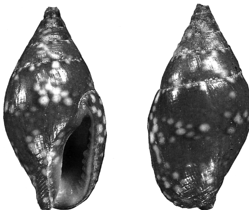
Pyrene jousseaumei Drivas & Jay, 1997 Holotype MNHN, 15.7 mm X 7.6 mm

Editor's note: we recommend to place this page between pp. 30 and 31 of Apex 12(1).