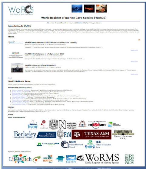
Figure 1. The WoRCS webpage.

A dynamic webpage (Fig. 1) dedicated to the WoRCS Thematic Species Database (TSD) had been developed by the WoRMS DMT in collaboration with the WoRCS founding editors. It is hosted under the webpage of the WoRMS (URI: http://www.marinespecies.org/worcs/ ) and the following citation for the current version of the database had been suggested (Gerovasileiou et al. 2016b):