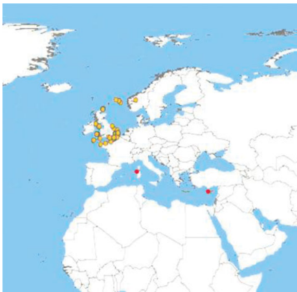
Fig. 3. Worldwide distribution of Scalibregma celticum : yellow dots represent the distribution as reported on the iOBIS website (Vanden Berghe, 2007); red dots represent Çinar's (2005) record in the Levantine Sea and our record in the Tyrrhenian Sea.

individuals, as well as a lack of investigation, particularly in the area analysed in this work. The two species of Scalibregma are easy to distinguish mainly due to the presence/absence of eyes as well as the presence/absence of blunt chaetae in anterior parapodia. For these reasons we can suppose that misidentification is to be excluded. Besides, the examination of the individuals found confirms the original description provided by Mackie (1991). All the distinctive characteristics of S. celticum have been identified in order to allow a clear distinction between this species and S. inflatum already reported in the 'Italian Checklist of Marine Fauna' (Castelli et al. , 2008). It is premature, at this stage, to give an opinion about the origin of the species or its possible dynamics of colonization/expansion. The record of other individuals, eventually coming from other areas of the Mediterranean, will enable more detailed studies, possibly using also genetic techniques, in order to make hypotheses about the origin and the colonization pattern of the species.