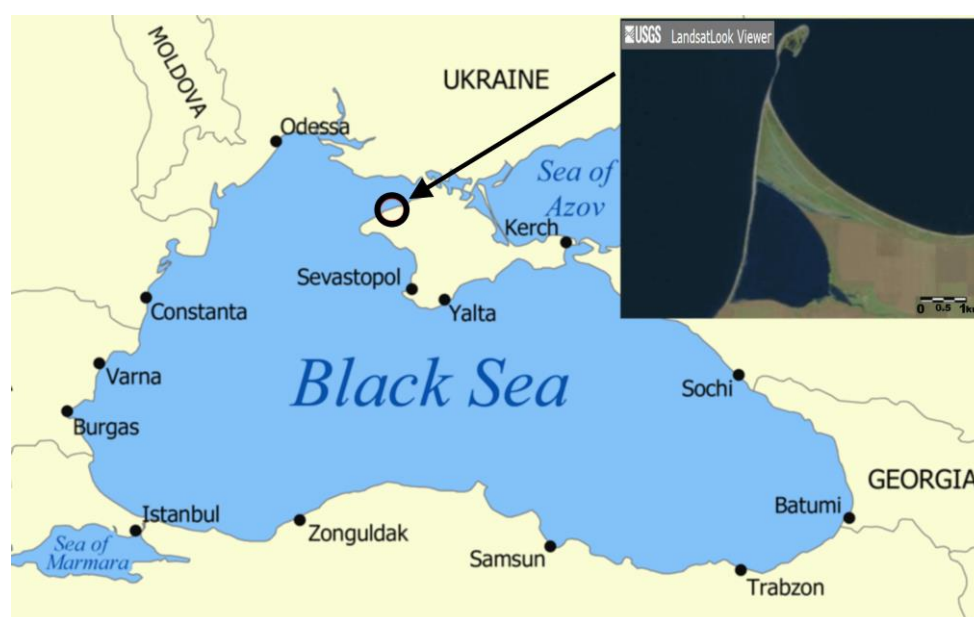
Figure 1. The hypersaline Lake Bakalskoye in the Crimea (Ukraine).