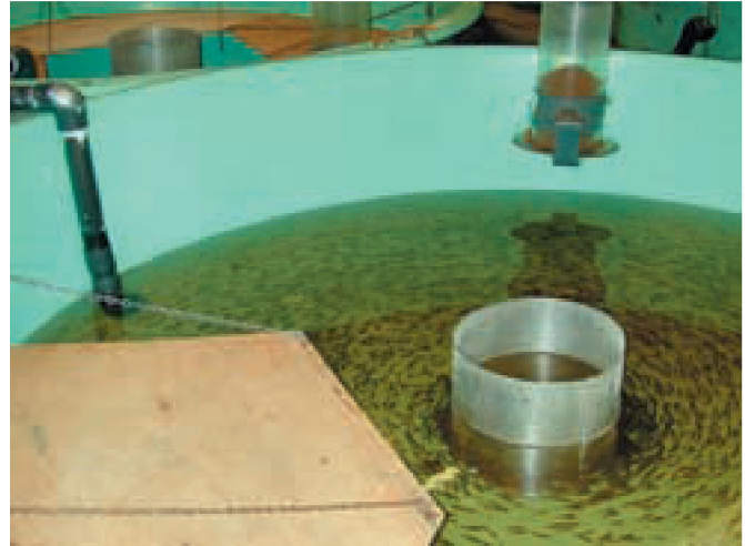
Salmon hatchery.

The improvement of cooperative daily contacts between molecular biologists, geneticists and traditional biologists and ecologists allows the use of molecular markers to discriminate individuals, populations, stocks and sister species of commercially important or endangered species. Among molecular probes, species-specific or highly polymorph genetic markers such as mitochondrial DNA fragments (16S rDNA, D-loop) or nuclear probes could be easily isolated and amplified, then characterised by electrophoresis and sequencing to provide useful tools to identify the individuals, to survey populations and to assess accurately both variety and variability of living organisms.