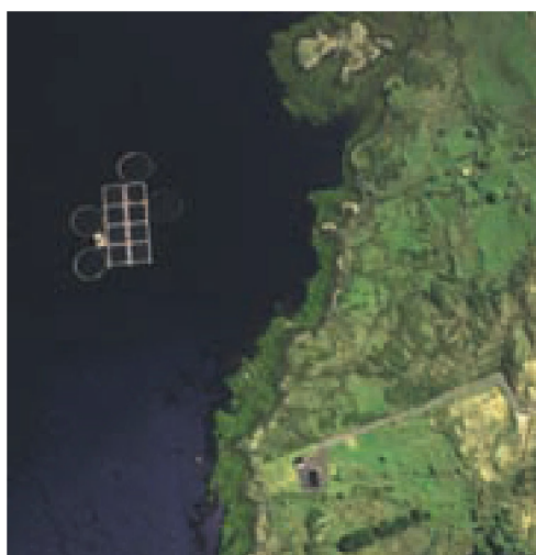
Marine fish farm.

Improved understanding of environmental, hormonal, nutritional and genetic control of reproduction as well as genetic selection of broodstock is required to optimise production and produce fish and shellfish of required growth, health and quality characteristics. Larval nutrition, diversification of marine organisms used for their first feeding, and development of efficient artificial diets for early larval stages together with feed-dispersing techniques would add to the quality of larvae and reduction of production costs. Exclusion of traditional raw materials from aquaculture feeds and possible limitation in the use of those remaining impose a great risk to aquaculture sustainability. New raw materials should be explored and/or developed for inclusion in fish feeds. Further understanding of the fish immune system and the relation of its condition to nutrition and stress would help in improvements in growth and disease resistance. The tools of molecular biology can furnish information about life cycles and mechanisms of pathogenesis, antibiotic resistance and disease transmission. Improved technologies must be developed for detecting and diagnosing pathogens and for enhancing the genetic basis of disease resistance. Improvements of the quality of the final product can be achieved through genetic selection and/or understanding of biochemical and hormonal control of tissue growth and nutrient deposition.