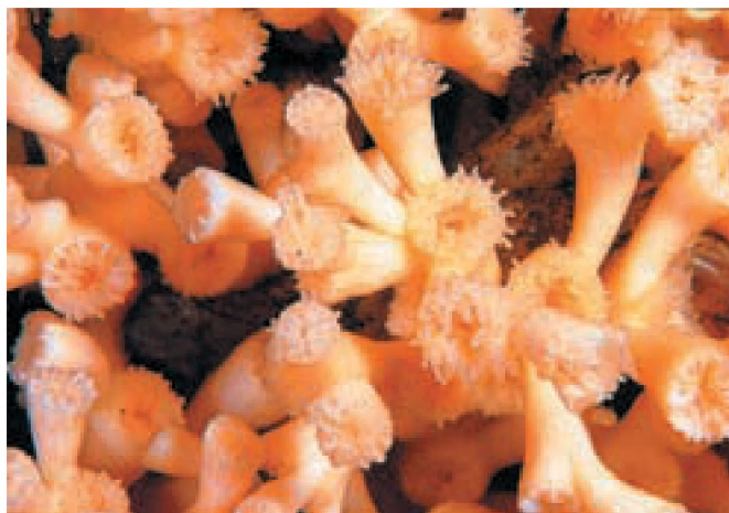
Lophelia pertusa – cold water corals “bioherms” found at depths of 200 - 1 000 m along the full extent of the European Atlantic margin.

Deep-sea hydrothermal vents now offer a new source of a variety of fascinating microorganisms well adapted to these extreme environments. This new bacterial diversity includes strains able to produce new molecules such as enzymes, polymers and other bioactive molecules. Screenings of isolates recovered from oceanographic cruises led to the discovery of a number of unusual microbial exopolysaccharides with interesting chemical and rheological properties. Among these polymers, poly- \beta -hydroxyalkanoates (PHA) are of special interest.