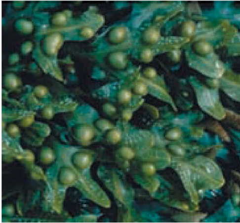
The brown seaweed, Fucus serratus , used in thalassotherapy in Europe.

reality, they bridge the gap between algae and bacteria. Their pigments, storage products, cell-wall components, ultrastructure, reproduction mode and morphology, amongst others things, identify the different classes. From a biotechnological point of view, the biochemical diversity in seaweeds provides a potentially enormous variety of products, some of them of current biotechnological use. For example, polysaccharides from certain red algae (carrageenans and agars) or brown algae (alginates) are still largely used as jellifying or thickening agents in the food industry, in cosmetics or even in building materials. Other examples are shown below.