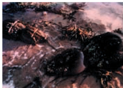
The lysate from the horseshoe crab provides the major assay for bacterial endotoxin.

The potential applications offered by the screening of marine substances extend to pharmacology, agrochemistry and the environment. Moreover, the use of combined approaches enhances these possibilities because marine molecules often belong to new classes without terrestrial counterparts; for example, halogenated compounds. High-throughput screening techniques are particularly suitable for such combined approaches. In addition, marine microorganisms are a source of new genes, the exploitation of which is likely to lead to the discovery of new drugs and targets. Secondary metabolites produced by marine bacteria and invertebrates have yielded pharmaceutical products such as novel anti-inflammatory agents (e.g. pseudopterosins, topsentins, scytonemin, manoalide) anti-cancer agents (e.g. bryostatins, discodermolide, eleutherobin and sarcodictyin) and antibiotics (e.g. marinone). Melanins have a range of chromophoric properties that can be exploited for sunscreens, dyes and colouring. They also sequester different kinds of organic compounds, inducing fungicides and antibiotics, which may allow them to act as slow-release agents.