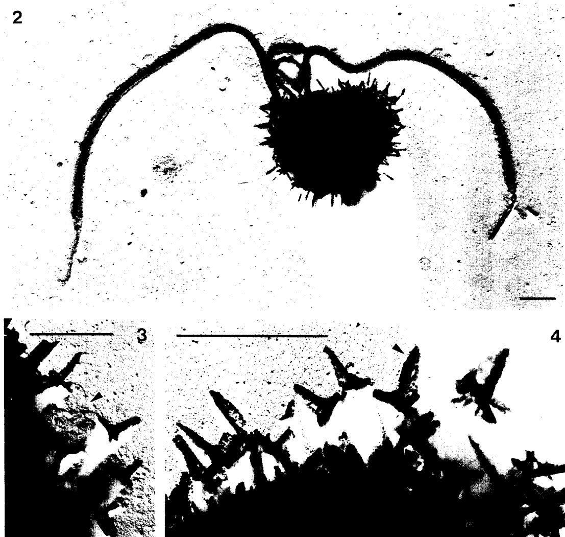
Figs 2–4. Eriolus spiculiger gen. et sp. nov. from the Isefjord, Denmark; shadowcast preparations for TEM. Fig. 2. Complete specimen with curved flagella and coiling haptoneuma. Fig. 3. Detail of periplast showing caltrops and unmineralised scales with concentric ridges (arrowhead). Fig. 4. Caltrops; the arrowhead points to a distinct ridge. Scale bars represent 1 \mu\text{m} .

Sinus Codani (lat. bor. 56^{\circ}00' , long. orient. 11^{\circ}51'0'' ) haustus, figuris 2–4 monstratus. Holotypus a Fig. 2 constitutus.