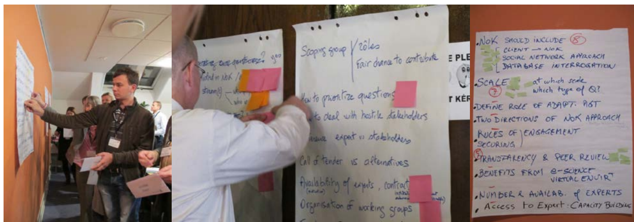
Figure 1: Impressions from the regional workshops (Copenhagen) – voting on most important issues to be tackled by creating a NoK

The issues rated highest by participants were discussed in break-out groups, mainly the first four in the list. The following section summarizes the main conclusions on the topics across the 3 workshops, which sometimes led to somewhat conflicting recommendations, thus also highlighting the different regional and knowledge holder perspectives. This is highlighted accordingly.