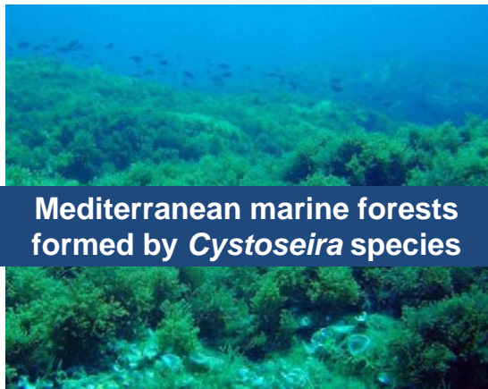
Mediterranean marine forests formed by Cystoseira species