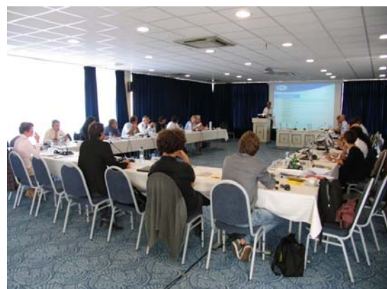
National Focal Points from the Mediterranean discuss the ICZM Stocktaking Questionnaire at Portoroz, 24 th September 2010

designed to provide a comprehensive analysis of the current legislative, institutional, policy and financial framework for ICZM governance at the different national, regional (sub-national) and local levels.