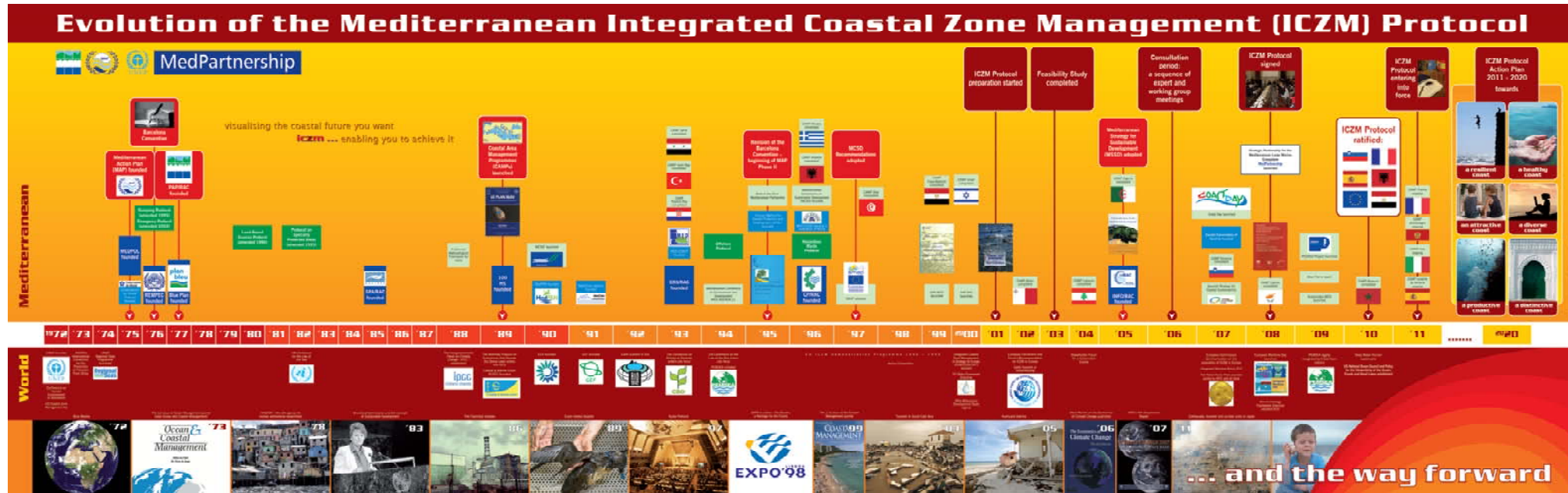
Appendix 3: Poster presented at PEGASO Project Meeting in Romania, July 2011 – zoom in for details