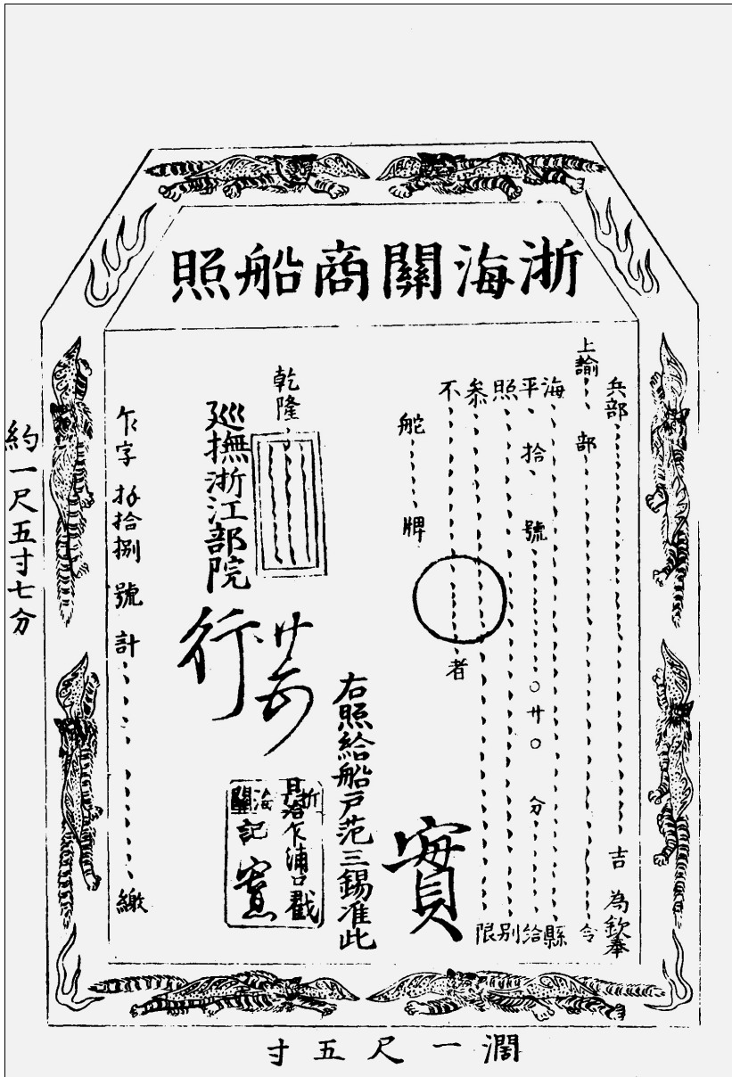
Ill. 3: Cover of a trading ship certificate of registration of the Zhejiang Customs Office ( Zhe haiguan shangchuan zhao 浙海關商船照) dating from 1795 (Qianlong 60), issued for a merchant called Fan Sanxi 范三錫 ( Shingoku kibun , 10.13a, 451).