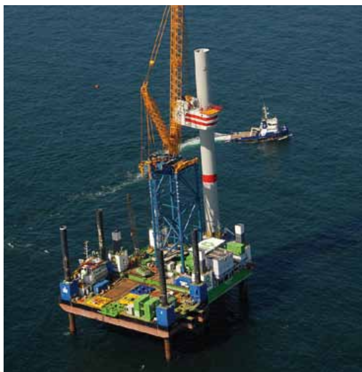
Assembly of a C-Power phase 1 turbine on the Thorntonbank.

The six turbines of C-Power's first phase were commissioned and producing electricity by May 10th, 2009.