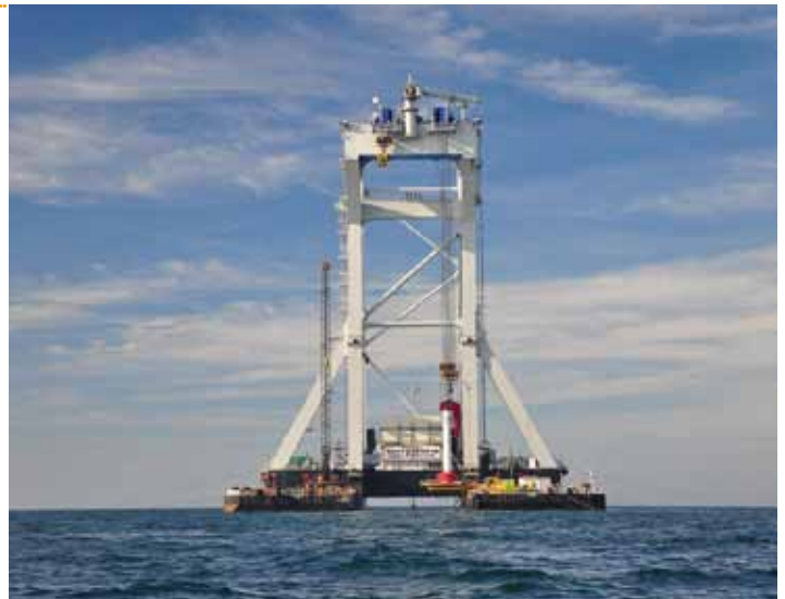
Piling vessel (with red and white hammer) at the Belwind site on the Bligh Bank.

A transition piece (TP) was installed on every Belwind monopile. The TP makes the connection between the MP and the wind turbine. In 2010, Belwind installed 55 wind turbines and one offshore high voltage station. The entire phase 1 of Belwind was fully operational from December 31st 2010 onwards.