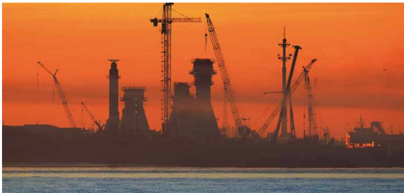
C-Power's onshore construction site of the gravity based foundations in Ostend.