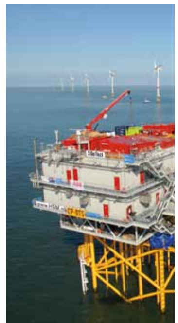
The C-Power offshore transformer station was installed on March 17th, 2012. On the background the six phase 1 turbines and ongoing jacket installation.