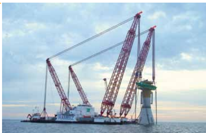
Transport of a gravity based foundation from the port of Ostend to the C-Power site at the Thorntonbank.