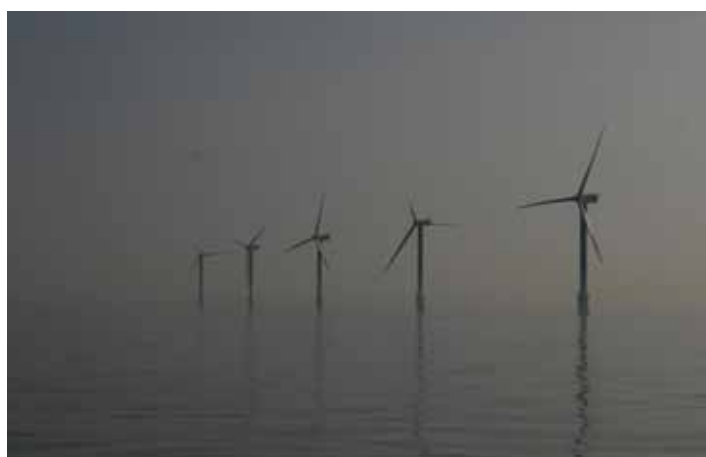
Phase 1 turbines on the Thorntonbank.