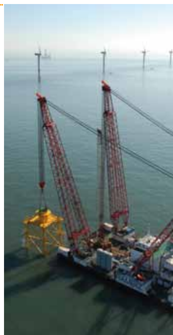
Phase 3 jacket installation at the C-Power site.