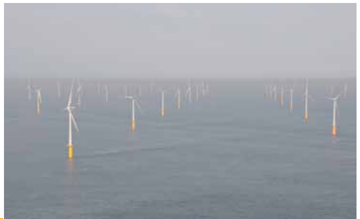
Belwind Phase 1 wind turbines on the Bligh Bank.

The construction of phase 2 and 3 of the C-Power project (i.e. 48 turbines and one offshore transformer station) started in spring 2011. The foundation type for the phase 2 and 3 turbines is different from the pilot phase since jacket foundations, instead of the GBFs, were installed. These foundations consist of a steel jacket with four legs. The foundations were installed using the pre-piling concept: four pin-piles were driven into the seabed and the legs of the foundation were grouted on the pre-piles.