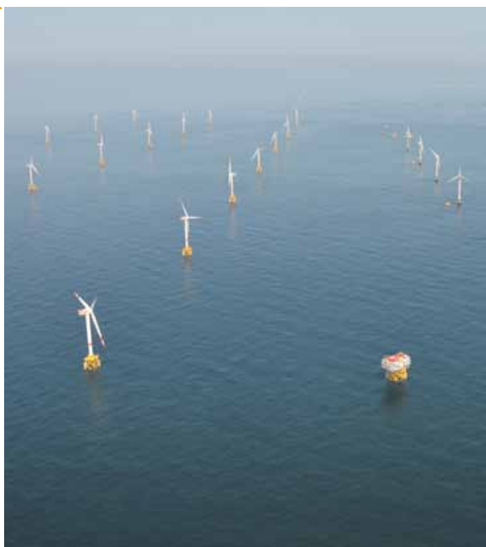
Partial view of the C-Power wind farm.