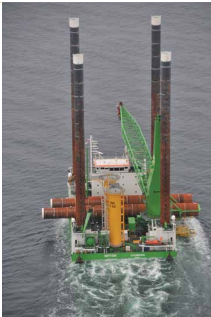
Vessel on its way to the Nortwind site on the Lodewijk-bank with two monopiles and two transition pieces.

In the summer of 2013 the entire C-Power wind farm was finalised and producing energy. The wind farm was officially inaugurated on September 17th, 2013.