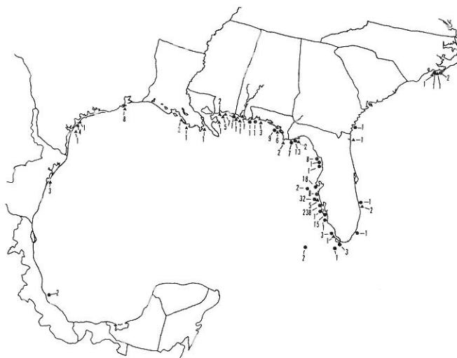
Fig. 3. Distribution of Bascanichthys scuticaris and B. bascanium . Numerals indicate numbers of specimens taken from collection sites and may represent two or more collections. Dots— B. scuticaris ; triangles— B. bascanium .

5.1–7.5, all in % TL; body depth 1.1–2.9% TL, 18.9–55.5% head length; eye diameter 24.0–42.9% snout length; 67–85 postanal vertebrae. Pectoral fin longer or shorter than wide. Teeth conical, recurved; uniserial in both jaws (45 specimens), or, in part, irregularly biserial on one or both sides of upper and/or lower jaw (9 specimens). Dentition of holotype anomalous for species; biserial on lower jaw, biserial and partially triserial on upper jaw. Premaxillary teeth usually three, larger than jaw teeth; vomerine teeth in two or three irregular rows anteriorly, becoming uniserial posteriorly. Cephalic lateralis system and lateral line ossicles as described for genus by McCosker (1977). Ground color brown to beige above midline, lighter below; dorsal and anal fins lighter than body.