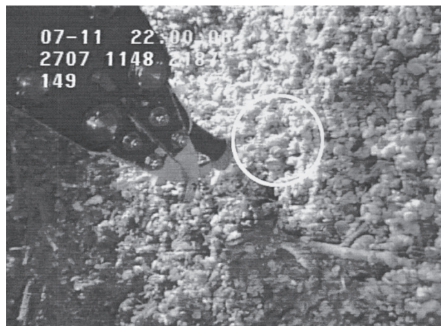
Figure 2. Determination of cm-scale faunal composition from a digitized video frame. A 5 cm circle (white) is drawn to estimate faunal abundance around the SUAVE chemical analyser probe tip.