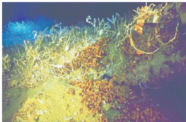
Figure 2. Tubeworms and mussels at densely populated “Bush Hill” chemosynthetic community in the Gulf of Mexico (Photo by Charles Fisher, Pennsylvania State University).

Significant production of an oil field does not appear to affect the health of chemosynthetic communities. Ten years of observations have shown that the densely populated, tubeworm-dominated “Bush Hill” community (Fig. 2)