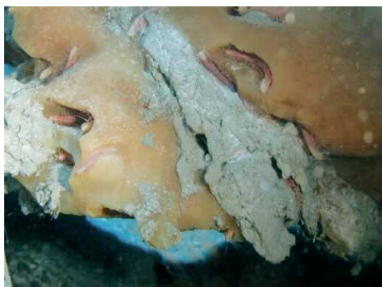
Figure 1. Polychaete “iceworms”, Hesiocaeca methanicola , living in burrows on gas hydrate (Photo by Ian MacDonald, Texas A&M University).

microorganisms produces H_2S through the reduction of SO_4 in seawater. Dominant seep community tubeworms ( Lamellibrachia sp. and an Escarpid species) possess posterior tube extensions, or “roots”, which serve as the primary site for sulphide uptake from the sediments through much of their life. The vascularized red anterior plume is more important to sulphide uptake earlier in the life of tubeworms. The tubeworms accumulate sulphide for oxidation by symbiotic chemoautotrophic bacteria. Seep mussels ( B. childressi ) host methanotrophic symbionts in their gill linings, but cannot bind methane. Consequently, these mussels occur only in areas with active hydrocarbon seepage (MacDonald, 2002).