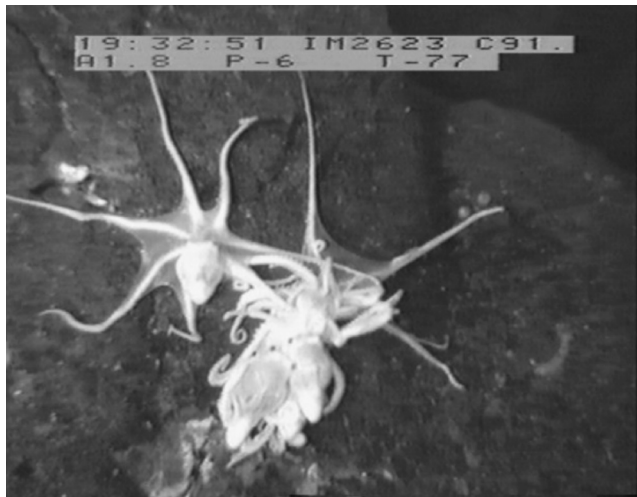
Figure 3. Group of five specimens of Vulcanoctopus hydrothermalis showing a probable reproductive behaviour comprising a mounting and a mating at distance.

A group of five specimens was observed from the submersible during a long time sequence of 2'17", probably showing a reproductive pattern that consisted of a "mounting" and a "mating at distance" (Fig. 3). All specimens showed similar size and appeared clearly mature in the video images. Although specimens were not collected at the end of the observations, their sexual maturity could be estimated by the development of the gonad, which was observable across the transparent thin skin. Three specimens were mounting a fourth (female?) whereas the fifth octopus was mating at some distance, using its hectocotylized arm.