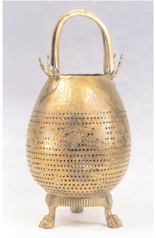
Figure 1. Ancient lamp holders (lanterns) from Northern Greece localities. A. The Vergina lantern coming from the tomb identified as that of King Philip II, dated to the third quarter of the 4 th century BC (Museum of Vergina royal tombs). B. The Derveni lantern found in one of the tombs at the necropolis of Ancient Lete, dated to the last quarter of the 4 th century BC (Archaeological Museum of Thessaloniki).

Figure 1. Lampe ancienne (lanterne) du nord de la Grèce. A. La lanterne Vergina venant de la tombe identifiée comme celle du Roi Philippe II, est datée du troisième trimestre du 4 ème siècle avant J.C. (Musée des tombeaux royaux de Vergina). B. La lanterne Derveni trouvée dans une des tombes de la Nécropole de l'ancien Lete, est datée du dernier quart du 4 ème siècle avant J.C. (Musée archéologique de Thessalonique).