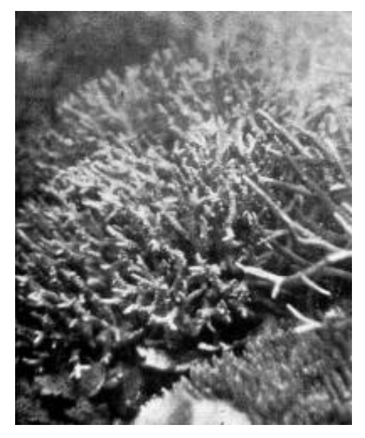
Fig. 10. Part of the reef with Acropora species at Hoorn (Ajer Besar). Underwater photograph by Verwey at a depth of 5 m (From: Verwey 1934)

maximum reef depths were measured at several islands by walking down the reef slope while releasing a piece of bamboo attached to a measuring rope (Verwey, 1931). Verwey also succeeded in underwater photography (Fig. 10). On 8 July 1931 he ended his reef studies in the field, by visiting several Islands (without diving) for the last time.