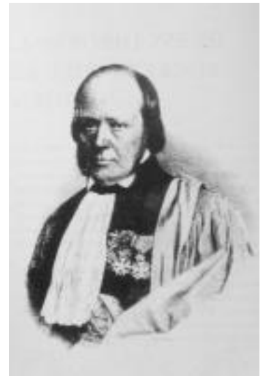
Fig. 4. Milne-Edwards

hood' for use under water. Milne-Edwards realized that this diving apparatus could be beneficial to zoological studies and decided to use it at the coast of Sicily. In March 1844, he left with fellow naturalist Armand Quatrefages (1810-1892) on a boat loaded with a large brass double forcing pump with balance beam and enough marines to operate this pump. The helmet appeared difficult to use, but after some time Milne-Edwards undertook underwater walks up to 45 minutes. There was always concern about security; a false alarm showed that, even in case of emergency, it took five minutes to pull him out of the water. For this reason he decided to restrict his dive depth to 8 m. Nevertheless, he succeeded to collect a great number of benthic animals, their eggs and larvae. Between dives he studied embryology and the blood circulation and nervous systems of various living marine animals (Milne Edwards, 1844).