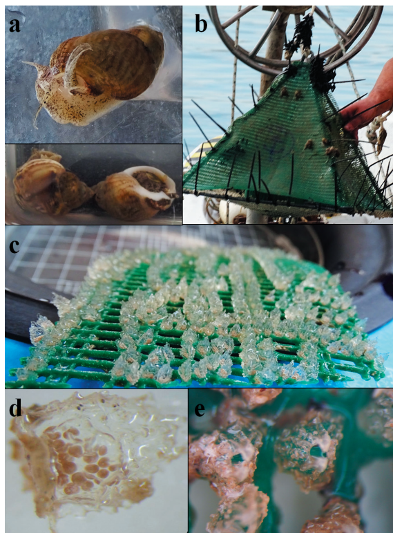
Fig. 1. a) Photographs of Tritia mutabilis specimens, b) Pyramid used as artificial substrate for T. mutabilis egg capsule deposition, c) T. mutabilis egg capsules laid on a pre-cut plastic net square on the side wall of a pyramid artificial substrate, d) egg capsule detached from the artificial substrate and observed at the stereomicroscope. Numerous embryos can be seen inside the capsule, e) hatched egg capsule presenting an apical opening

2015). The consumption of this species is popular among the local population and, in winter time, it represents an important source of income for small scale fishery in the Adriatic Sea, accounting for 19.6% of the total catch and 13.0% of the total revenues in the year 2011 (IREPA, 2012). Fishing activity is conducted in the period between early fall and late spring using small cone-shaped basket traps baited with dead fish (GRATI et al. , 2010), and it is regulated in terms of fishing periods, maximum daily catch amount, minimum landing size (20 mm shell height), and sanitary classification of the catching sea areas in accordance with Regulation 854/2004 / EC (EUROPEAN COMMISSION, 2004). Despite such a detailed regulatory framework, T. mutabilis resource has undergone a constant decrease in