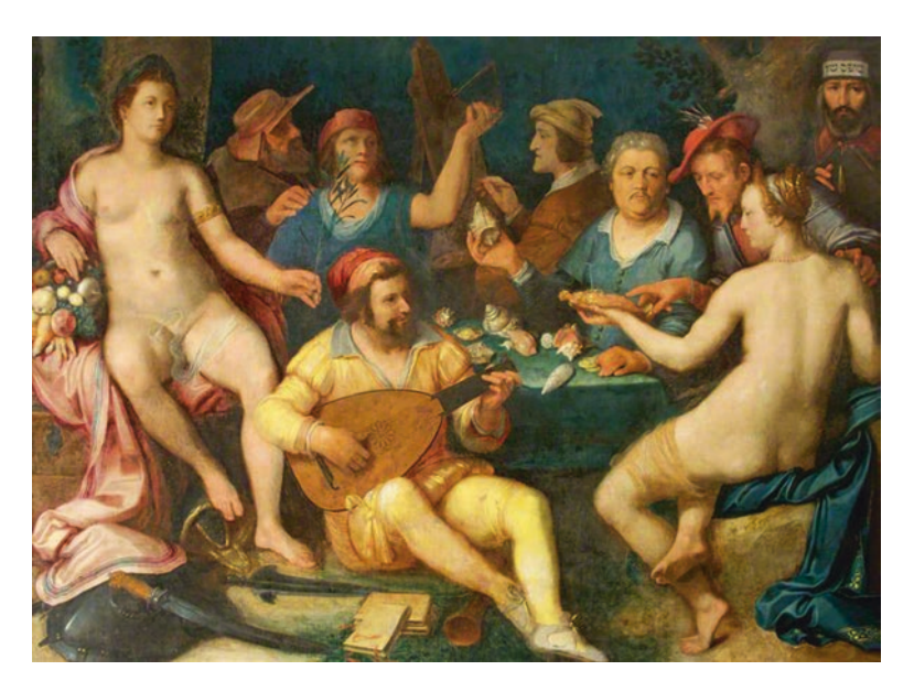
Fig. 20.1 'Peace and the Arts' by Dutch artist Cornelis van Haarlem (also known as Cornelis Cornelisz). Painted in 1607, it illustrates the early use of tropical and sub-tropical marine shells in art as a direct consequence of wider international trading and exploration by Europeans. Shell specimens include: Strombus pugilis (tropical and sub-tropical west Atlantic and Caribbean), Trochus niloticus (tropical Indo-west Pacific), Cymbiola vespertilio (tropical western Pacific), Harpa doris (tropical and sub-tropical eastern Atlantic), Conus sp. and Hippopus hippopus (Indo-west Pacific). (Identification from Dance 1986) (Image: National Trust)