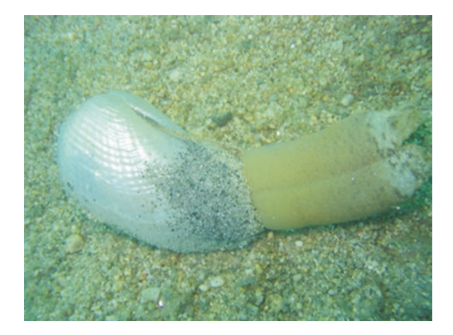
Fig. 20.4 Pholadomya candida , Colombia.

Spondylus regius is a spectacular shell with a long history of popularity and value. The species was probably known to collectors even before it was described by Linnaeus in 1758, and Dance (1969, 1986) provides a number of anecdotes regarding specimens of this species. Such was the fame and value of some individual shells that their transactions, owners and even prices paid are a matter of historical record. As such, many of these famous shells are still to be found in national museums, providing a physical testament to the provenance. For example, the