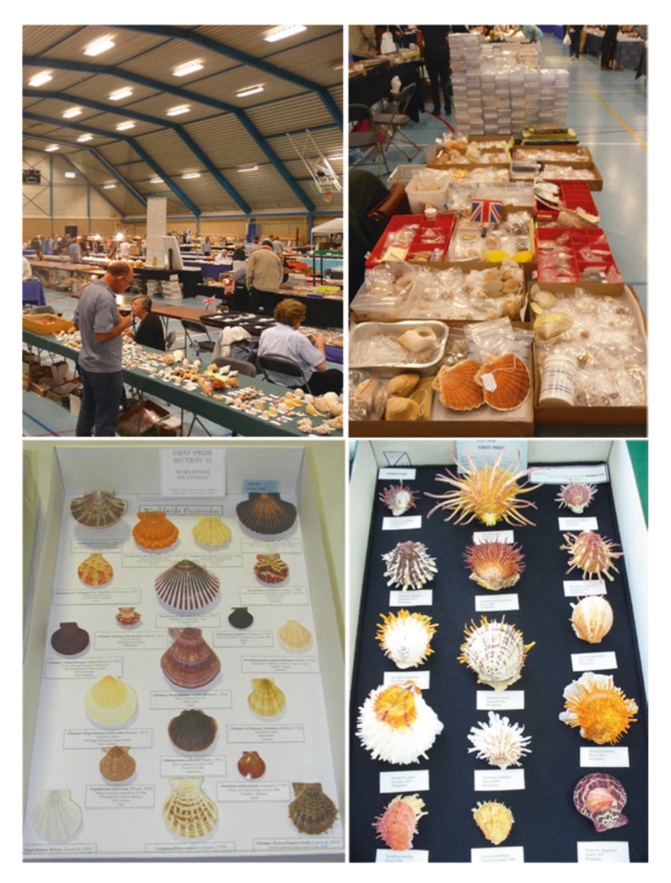
Fig. 20.7 International shell shows. Clockwise from top left: dealer tables where specimens are sold, exchanged or displayed, table detail showing specimens and storage containers for sale, prize-winning competition displays showing collections of Spondylidae (thorny oysters) and Pectinidae (scallops). Note the use of standardized display box sizes and specimen collection data for competition entries