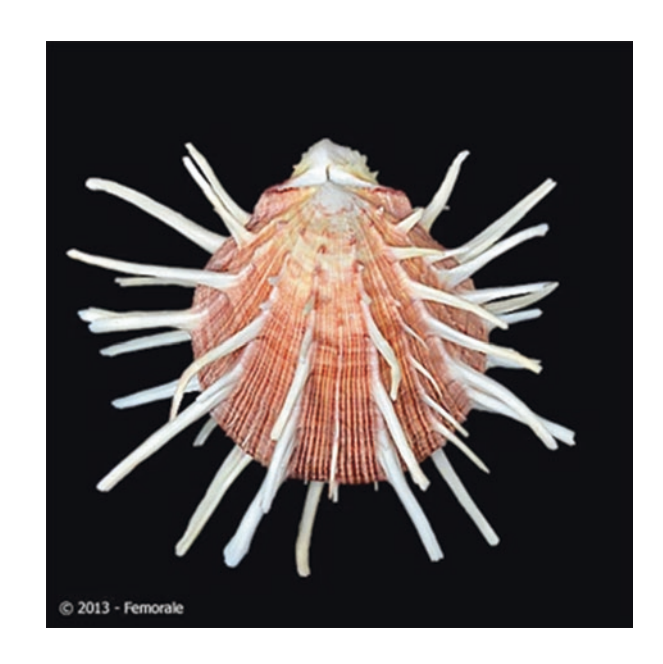
Fig. 20.5 Spondylus regius.

famous conchologist G. B. Sowerby 1st, purchased the famous Tankerville collection in 1824, including a fine specimen of Spondylus regius , which was sold the following year for £25 (€30). This is around the same price that a good specimen would cost today, although in 1825 the relative value was the equivalent of over £2500 (€3000). As with many shells, the individual colour, locality and condition, particularly of the prominent spines in this species, determine the value, although recent prices range from as little as €5 up to €50.