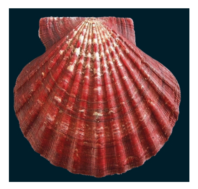
Fig. 20.6 Nodipecten magnificus.