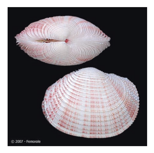
Fig. 20.3 Fimbria soverbii from Australia.

Dance (1969) states that "in the second half of the nineteenth century this was one of the few coveted bivalves" with "fine specimens seldom seen in collections." This is probably still true today. At auction in 1865 only Pholadomya candida (see below) attracted a higher price. The species is not exceptionally rare, but seems to appear irregularly for sale and still commands a relatively high price of around \notin 70–80, depending on condition, size, appearance and locality.