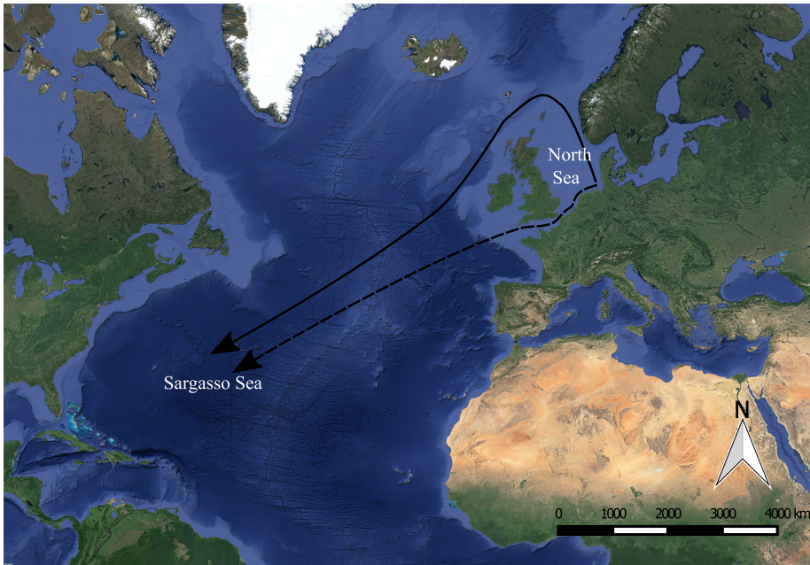
Figure 8.1: Possible silver eel migration routes from western and northeastern Europe. Solid line: Nordic migration route based on Tesch (1979) and Westerberg et al. (2014); dashed line: southwestern migration routes through the English Channel based on the results of the present study.