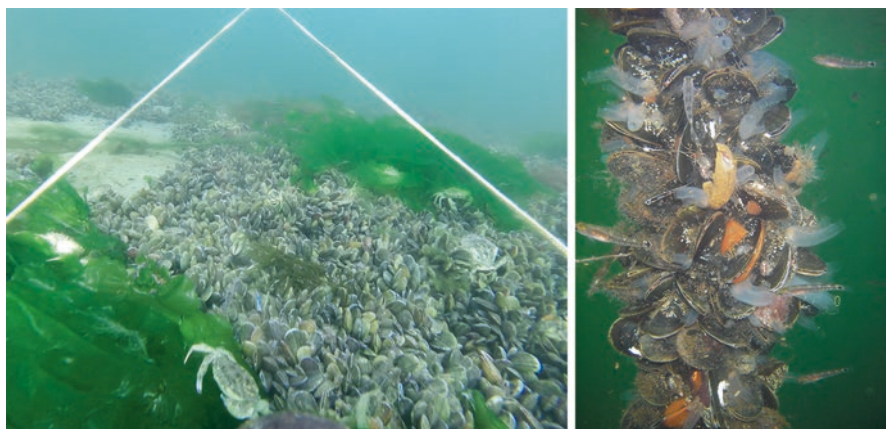
Fig. 14.1 Mussel aquaculture on bottom plots (left) and suspended ropes (right) demonstrating that cultures include a rich community of flora, epifauna and mobile fauna (crabs, fish) species.

In conclusion, there seem to be some generic drivers, but one should realize that the influence of the mentioned drivers depend strongly on the local hydrodynamic, topographic and biogeographic conditions.