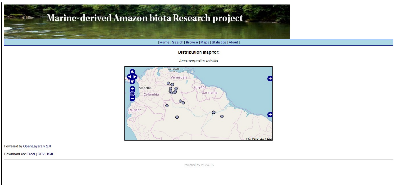
Figure 2 – Distribution map for a selected species.