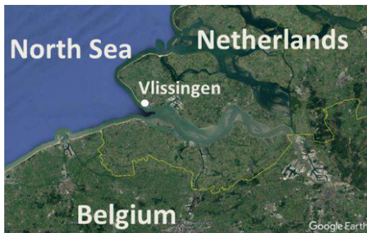
Figure 1. Study area.

An important model result is that stronger tidal currents are crucial to prevent sedimentation in channels caused by SLR. This result and other findings will be discussed during the presentation.