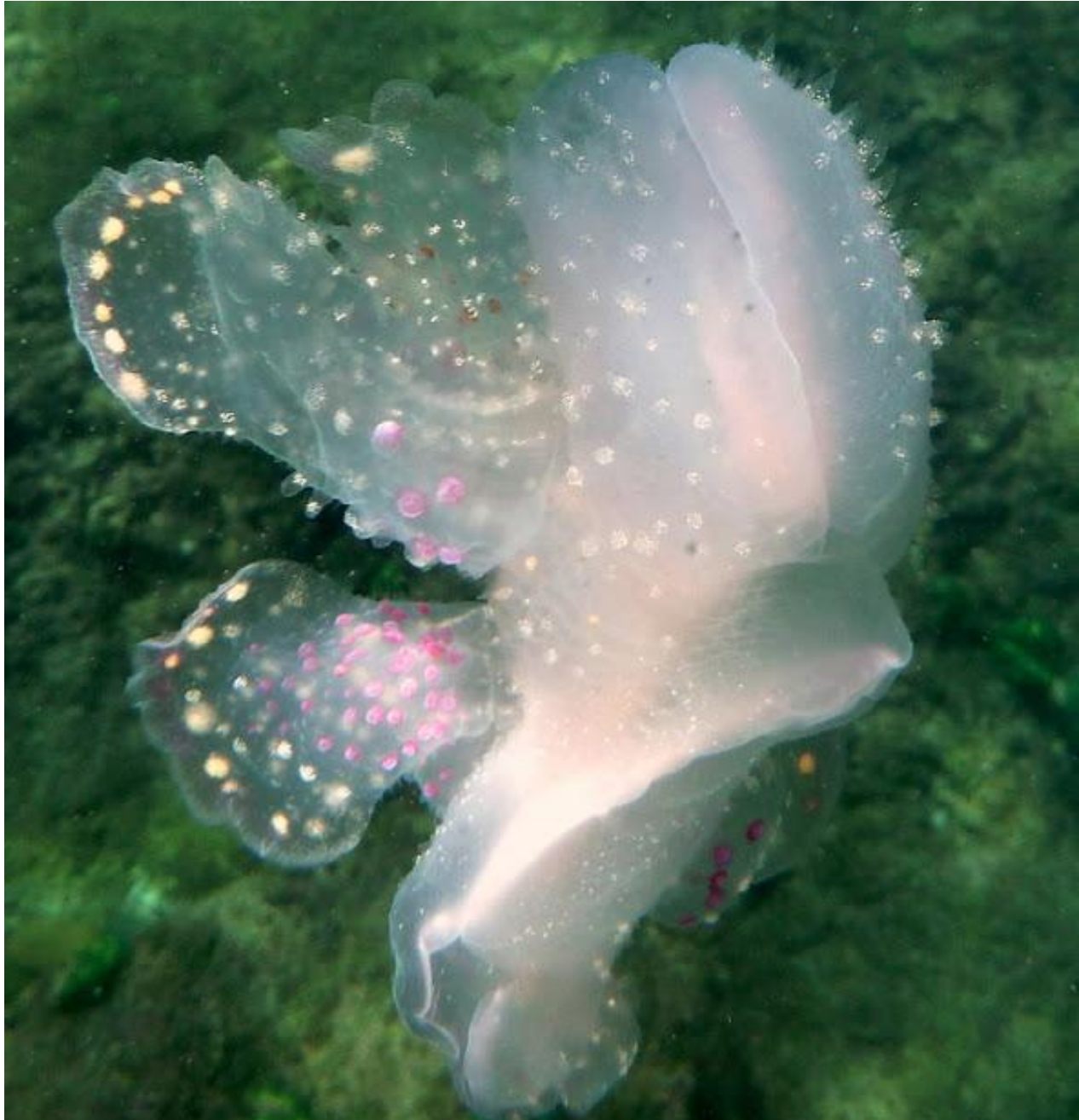
Figure 3. Melibe japonica specimen in close up.