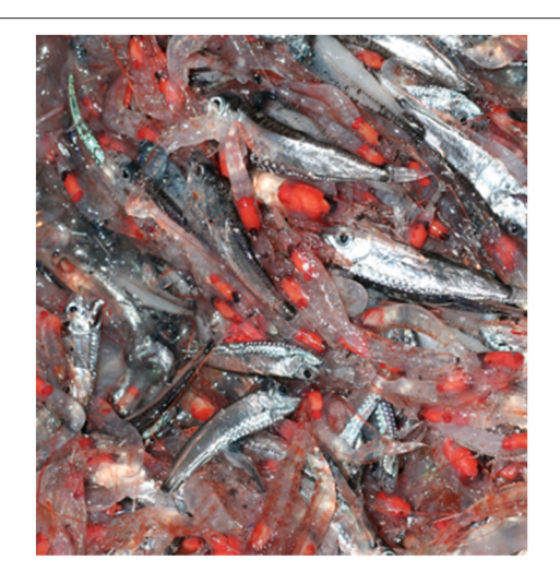
FIGURE 1 | Representative sample of mesopelagic fish including Maurolicus muelleri, Sergestes arcticus, and Benthosema glaciale and plankton e.g., Meganyctiphanes norvegica in the deep scatter layers of the Irminger Sea in November 2013.

(Feagans-Bartow and Sutton, 2014), the community forms distinct acoustic scattering layers at around 500 m over large expanses of the ocean during day-time, ascending to the upper 150 m and dispersing at night (Figure 2). This diel migration has been referred to as the "largest daily migration of animals on earth" (Hays, 2003; van Haren and Compton, 2013). The discovery of new species from viruses to large vertebrates is regular in this oceanic zone, supporting estimates of a million undescribed species living in the deep pelagic (Robison, 2009).