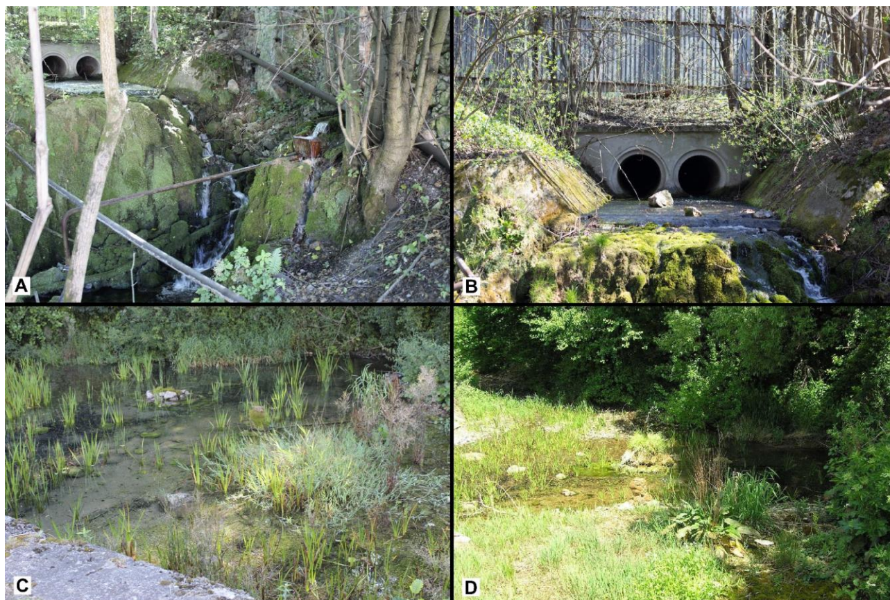
Figure 9. The type locality of Bythinella steffeki n. sp. in Slovenský Kras Mountains at foot of Plešivecká Plateau in Kunova Teplica. Spring Závodná Vyvieračka: A. General view on the spring zone with a travertine cascade; B. Artificial water outlet from Závodná Cave; C. Spring pond at high spring water outlet; D. The same pond during dry summer.

Habitat: The new species inhabits a karstic spring zone of Závodná Vyvieračka (Fig. 9), consisting of an artificial concrete channel, small travertine waterfall, short river bed with larger limestone boulders, and an artificial pond adjacent to the spring. The spring is associated with a short conglomerate cave, inhabited by Hauffenia sp., but without presence of B. steffeki n. sp. The water outlet of the spring seasonally varies from 40-200 l/s with average temperature 10.2° C, pH 7.485 and conductivity 508 µS. The single known locality is inside an engineering plant in an industrial zone. Despite the environmental care of the management, it is still threatened by handling of mineral oils and recycling of iron deposits nearby.