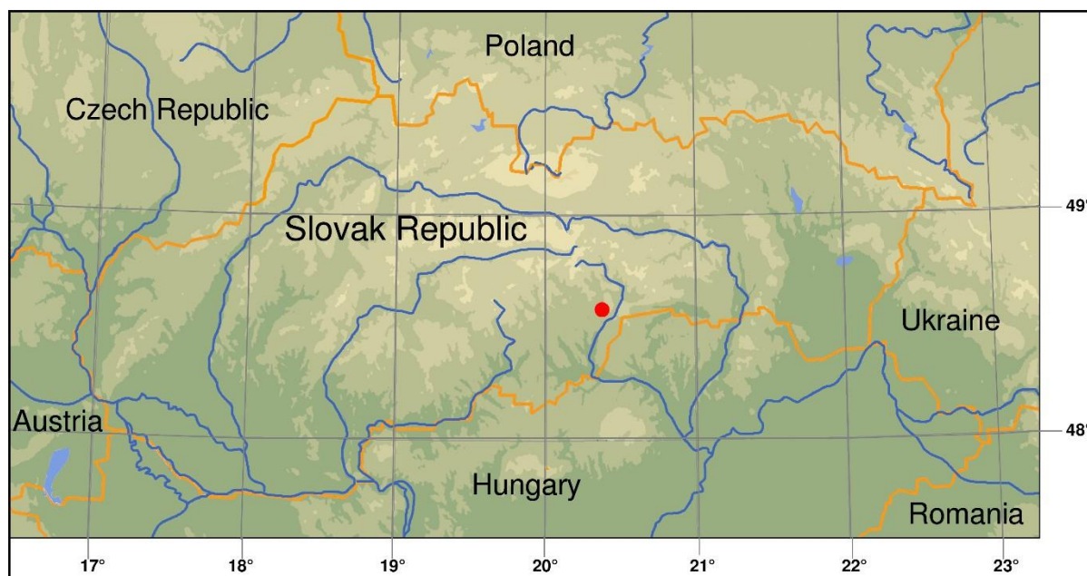
Figure 1. The sampling site of Bythinella steffeki n. sp. (red dot).