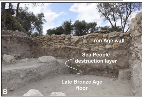
Figure 2. The harbour town Gibala-Tell Tweini and the Sea People destruction layer. The picture A is an aerial view of the eastern part of the excavation field A at Gibala-Tell Tweini. The picture B shows the Sea People destruction layer with ashes, stone rubbles from fallen walls, and ceramic fragments. doi:10.1371/journal.pone.0020232.g002