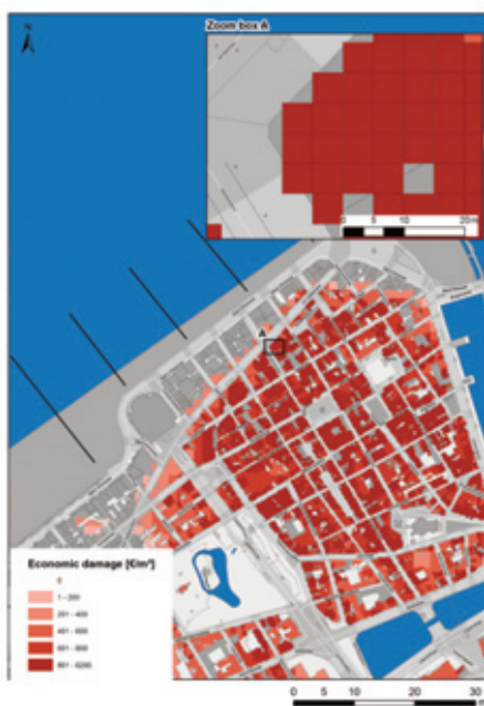
Figure 3. Flood risk calculation using the FLIAT model

Extensive laboratory tests to study wave impact on beach-dike configurations typical of the Belgian coast have been carried out (Figure 4).