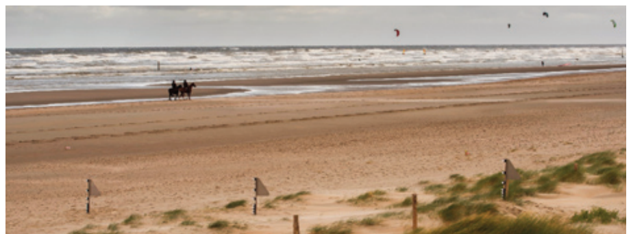
Figure 2. Aeolian sand transport campaign. On the foreground three Modified Wilson And Cook (MWAC) sand traps are visible.

It became also clearer that the road to efficient and accurate design of the optimized coastal defense systems of tomorrow involves a variety