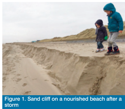
Figure 1. Sand cliff on a nourished beach after a storm

To improve the knowledge of the Belgian coastal system, researchers from knowledge institutes and private companies with great interest and expertise in physical coastal processes joined forces in 2015 and set up the CREST project.