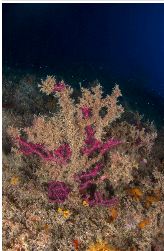
Fig. 1. Paramuricea clavata colony partially covered by epibionts.

Records of water temperature from the buoy of Melilla (the nearest place with available data) at 15 m depth in 2017 showed a maximum temperature of 28.6 °C in mid–August ( Puertos del Estado webpage, http://www.puertos.es/es-es/oceanografia/Paginas/portus.aspx ). At each depth, we quantified