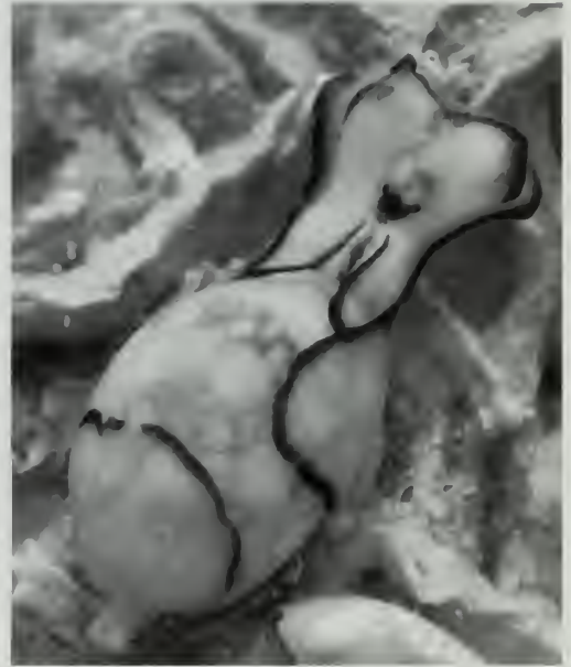
Figures 1 - 2. Haminoea cyanomarginata Heller & Thompson, 1983 1. Off Id-Delli, Malta 2. Greece