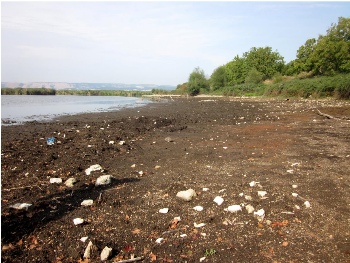
Figure 9. Eastern bank of lake Pamvotis, normal water level is almost up to the vegetation. (Photo by R. Reuselaars).

Our contribution to the knowledge of springsnails in Greece is important if we want to protect these species. Springs are very sensitive ecosystems (Cantonati et al. 2006, Savić et al. 2019). Most species in Greece are serious under stress where springs are used for drinking water or irrigation purposes. Human impact has led to the extinction of many springsnail species in the past and will lead to more extinctions if they will not be protected. But this is not only the case with springs. During a field trip in september 2019 we noticed the very low water levels in the lakes Prespa, Kastoria, Zirou and Pamvotis (see figure 9). Most of these lakes are used as water reservoir for irrigation and/or drinking water and a combination of long droughts and closing the water supply from springs (i.e. the springs at the east bank of lake Pamvotis) have led to these very low water levels. At the eastern bank of lake Pamvotis we saw hundreds of fresh shells of Sinanodonta woodiana (introduced) and Viviparus hellenicus in the mud, all died during the summer. At lake Zirou this was the case with Unio crassus . All these species also live in deeper water of these lakes, so most likely they will survive, for now. This is just another example of human impact on freshwater ecosystems which can lead to the extinction of species.