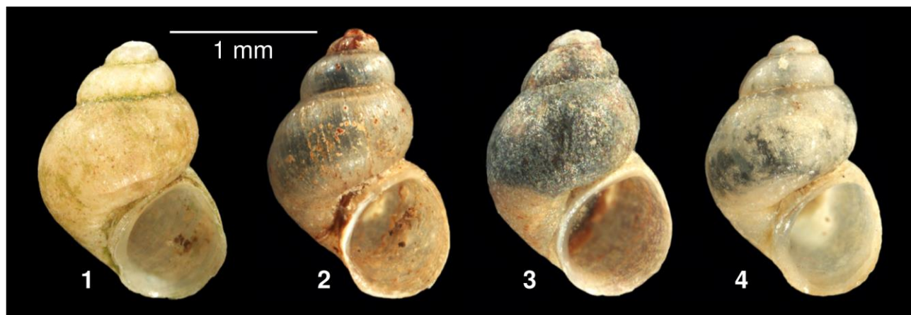
Figure 2. The new Pseudamnicola spp. 1: Pseudamnicola stasimoensis n. sp., 2: Pseudamnicola lesbosensis n. sp., 3: Pseudamnicola samoensis n. sp., 4: Pseudamnicola skalaensis n. sp.

Distribution: Greece; only known from type locality.