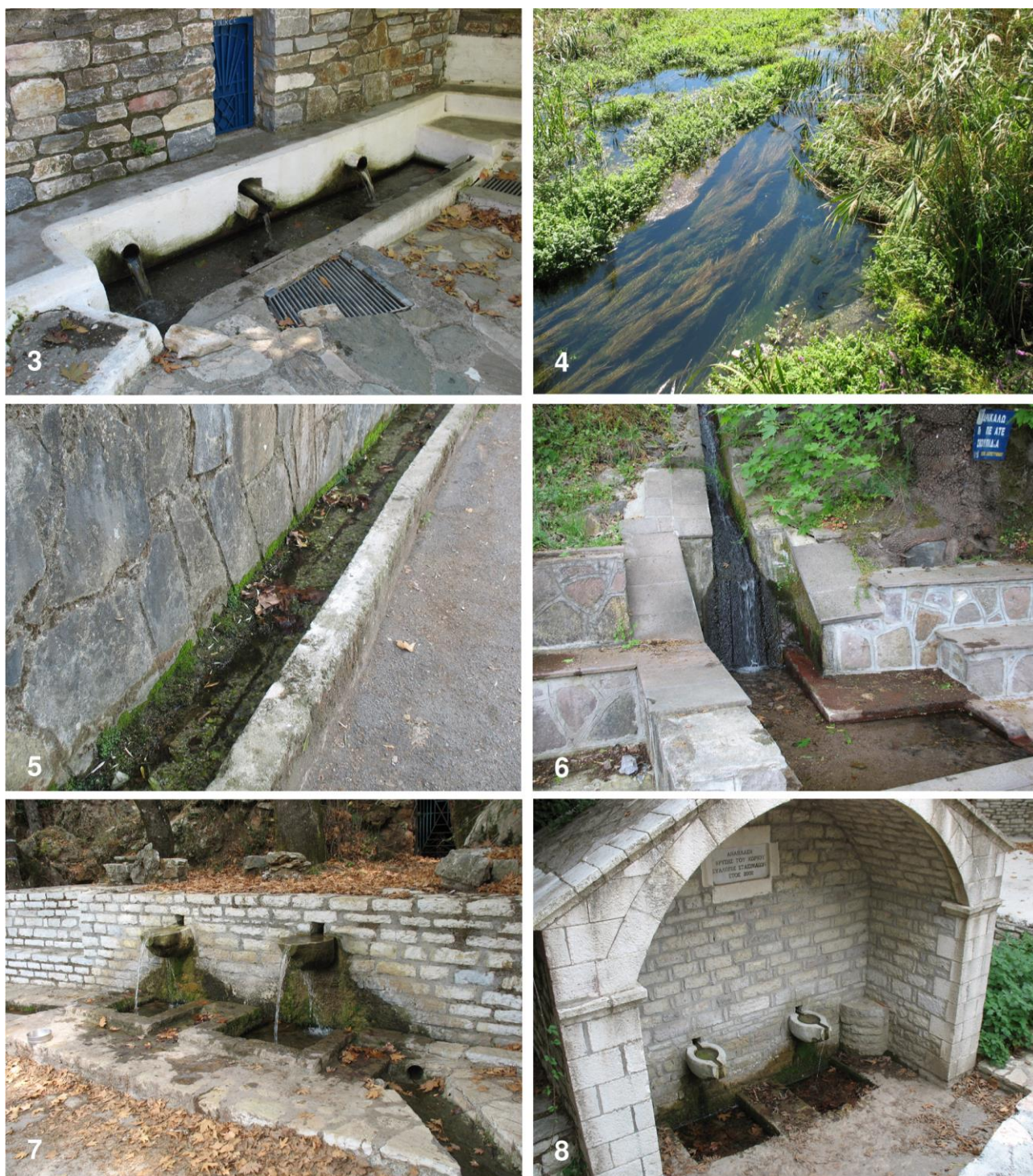
Figure 3-8. The type localities of the new Pseudamnicola spp. 3: Spring in Pnaka, type locality of P. samosensis , 4: Vasilopotamos river, near the bridge west of Skala, type locality of Pseudamnicola skalaensis , 5: spring in Tripi, secondary locality of P. skalaensis , 6: spring between Argenos and Lepetymnos, type locality of P. lesbosensis , 7: spring 0.5 km northeast of Stasimo, type locality of Pseudamnicola stasimoensis , 8: spring in Stasimo secondary locality of P. stasimoensis .

spring where they live in and which is already under human pressure. Pseudamnicola stasimoensis is known of two springs with a very small habitat. This species is also considered as critically endangered due to human pressure. We do not consider Pseudamnicola skalaensis as endangered because it is living in in the spring in Tripi and the Vasilopotamos river near Skala town. However if someone decides to clean the gutter of the spring in Tripi this species most likely will be eradicated from this location.