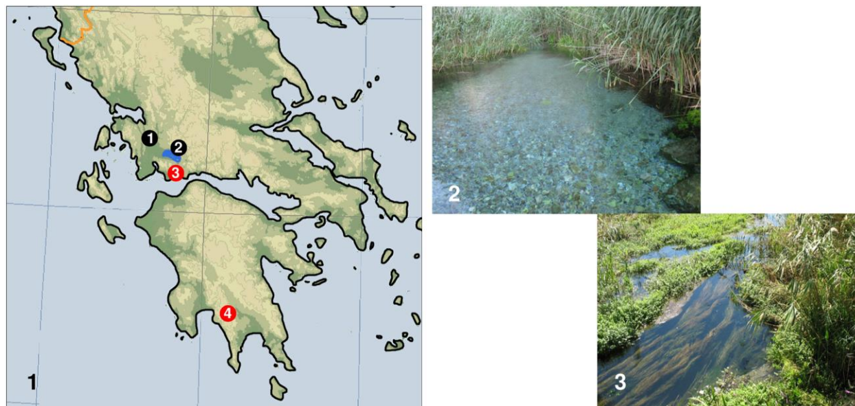
Figure 1-3. 1: The type localities of Islamia spp. in continental Greece. 1.1: Islamia graeca Radoman, 1973, 1.2: Islamia trichoniana Radoman, 1978, 1.3: Islamia papavasileioui n. sp., 1.4: I. skalaensis n. sp. 2: outflow of the spring in Kryoneri, the difficult to access type locality of I. papavasileioui n. sp. is behind the reed bed, 3: Vasilopotamos river, near the bridge west of Skala, type locality of I. skalaensis n. sp.

In this article we present our findings on the freshwater genus Islamia from Greece. As shown on the map, the distribution of this genus is concentrated in southern continental Greece and one species in the southern Peloponnesos. It seems to be absent in the other parts of Greece. On many fieldtrips in Greece in the past 20 years (e.g., Glöer & Hirschfelder 2019, Glöer et al. 2018, Glöer & Reuselaars 2020), no other Islamia sp. were discovered in those parts.