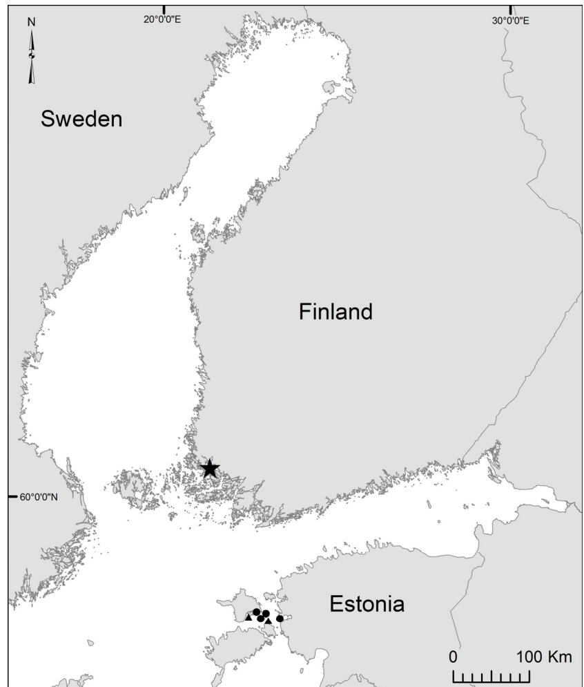
Figure 1. Location of first capture of Maeotias marginata in the archipelago of SW Finland (star) in 2012 (N 60.4887, E 21.7707), and the Estonian localities from 1999 (Väinölä and Oulasvirta 2001; solid circle) and 2002 – 2003 (Simm and Põllumäe 2006; solid triangle).