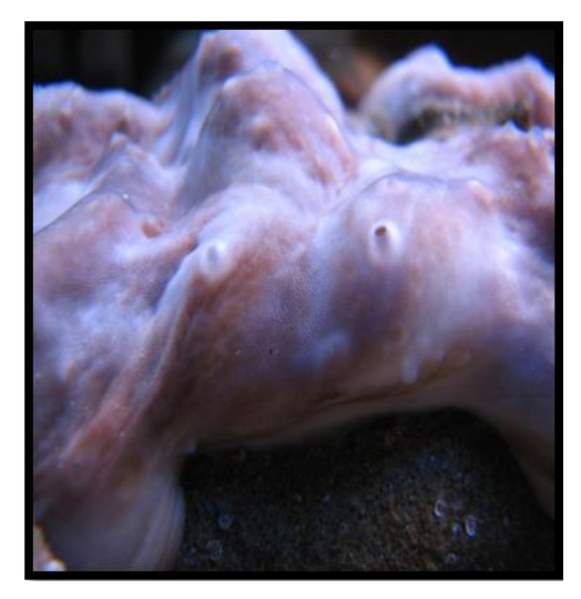
Fig 9: Chondrosia reniformis

Material reported: Chondrosia reniformis was encountered on sandy areas of Shallow water of Albassit, Ibn Hani, Banias, and Tartous Fig 9 Table 8.