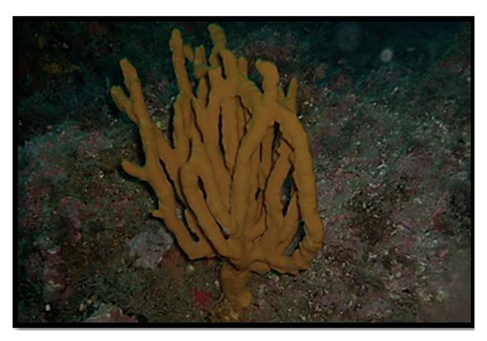
Fig 10: Axinella verrucosa

Material reported: Axinella verrucosa was encountered on rocks of Shallow water of Albassit, Ibn Hani, Banias, and Tartu's Fig10 Table 9.