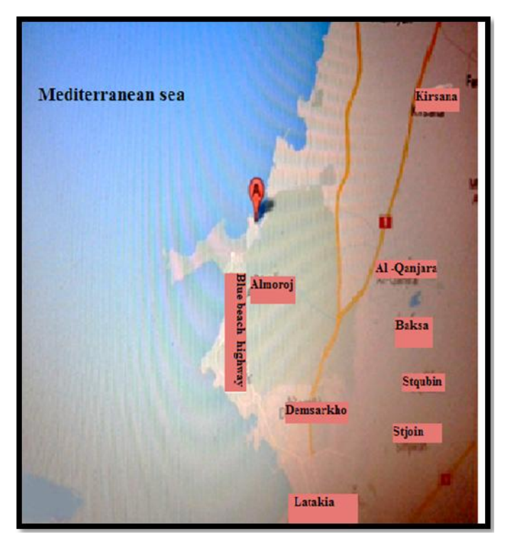
Fig 1: sampling sites

The study site was focused Sub littoral zone at depth ranged between 15-30 m of marine protected area Ibn Hani at Latakia's blue beach area 10km away from the city center where the habitat is rocky and sandy Fig1.