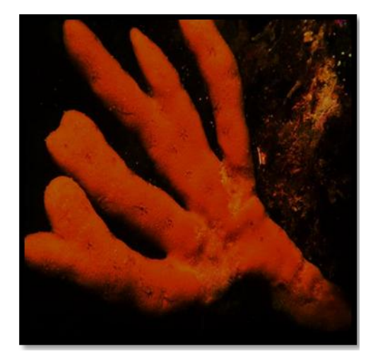
Fig 11: Axinella polypoides

Material reported Axinella polypoides was encountered on rocks of Shallow water of Albassit, Ibn Hani Fig11 Table 10.