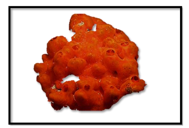
Fig 4: Crambe crambe

Crambe crambe, Myxilla incrustans-species detected: Crambe crambe (schmidt1862) was previously reported from the sublittoral area of Albassit, Ibn Hani and Tartous regions Fig4 Table 3.