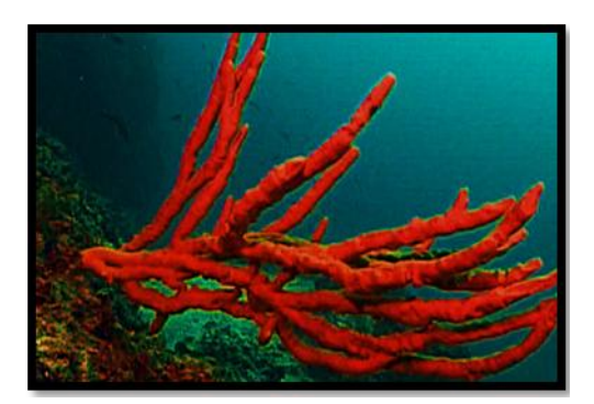
Fig 12: Axinella cannabina

Axinella cannabina (Esper, 1794) Material reported Axinella cannabina was encountered on sublittoral rocky substrate of Albassit, Ibn Hani, Banias and TartousFig12 Table 11.