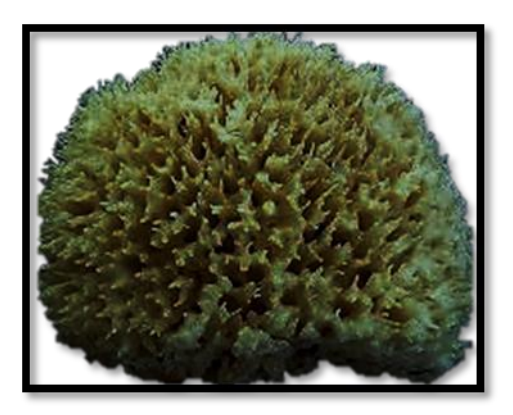
Fig 7: Spongia officinalis

Material reported Spongia officinalis was reported at the sublittoral area of Ibn Hani and Tartous Fig7 Table 6.