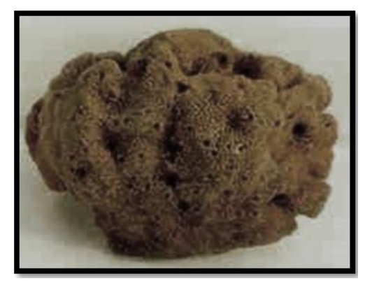
Fig 8: Hippospongia commuis

Material reported: Hippospongia commuis was reported at the sublittoral area of Albassit, Ibn Hani and Tartous Fig8 Table 7.