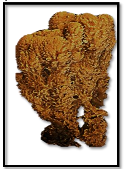
Fig 2: Agelas linnaei

Material examined: 1 specimen that was collected from Sub littoral area at 15-30 m of Ibn Hani region during April – May/2014. Fig2 Table 1.