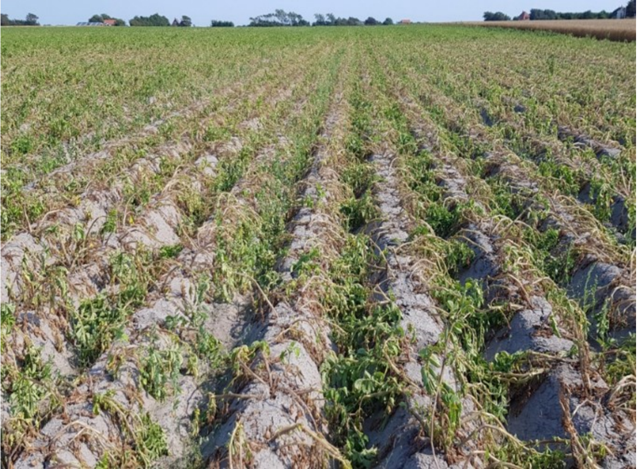
Drought 2018 potato field conventional farming, © Salt Farm Foundation