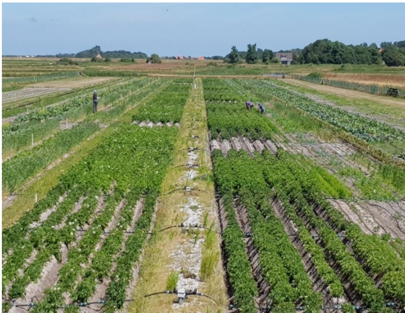
Drought 2018 Irrigation with brackish water