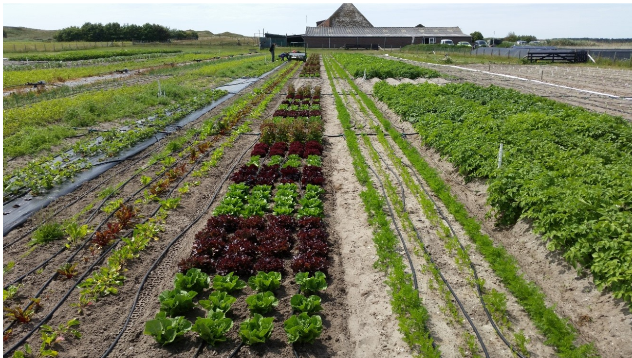
Test field location Texel, Netherlands, © Salt Farm Foundation

including climate experts, microbiologists, economists, soil experts, entrepreneurs and policy makers. Scientists work closely together with farmers to find practical solutions.