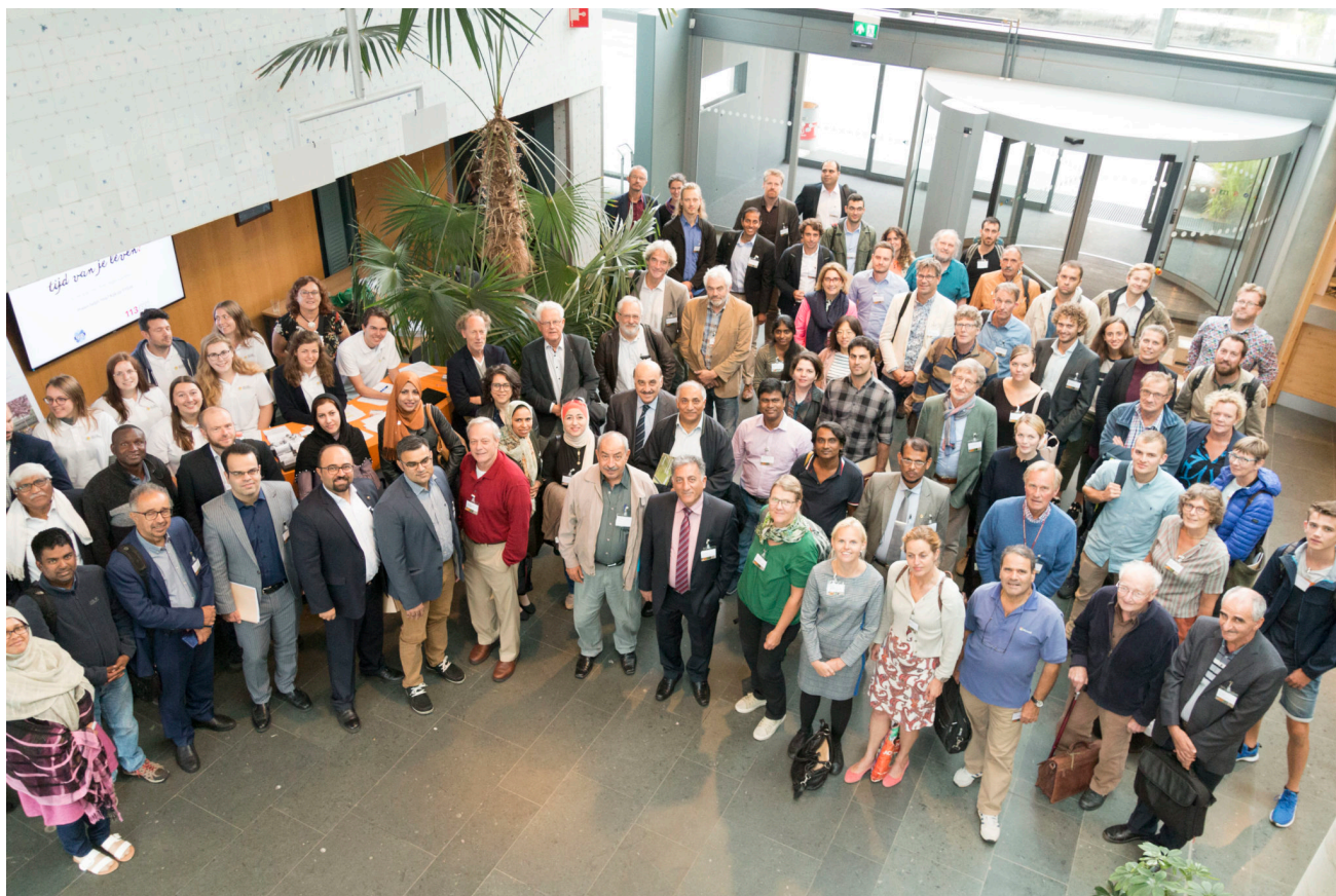
Participants at the conference

The event covered a broad range of themes, from revitalising saline lands to promising crops and governance. More information including streamed keynote speeches can be found here .