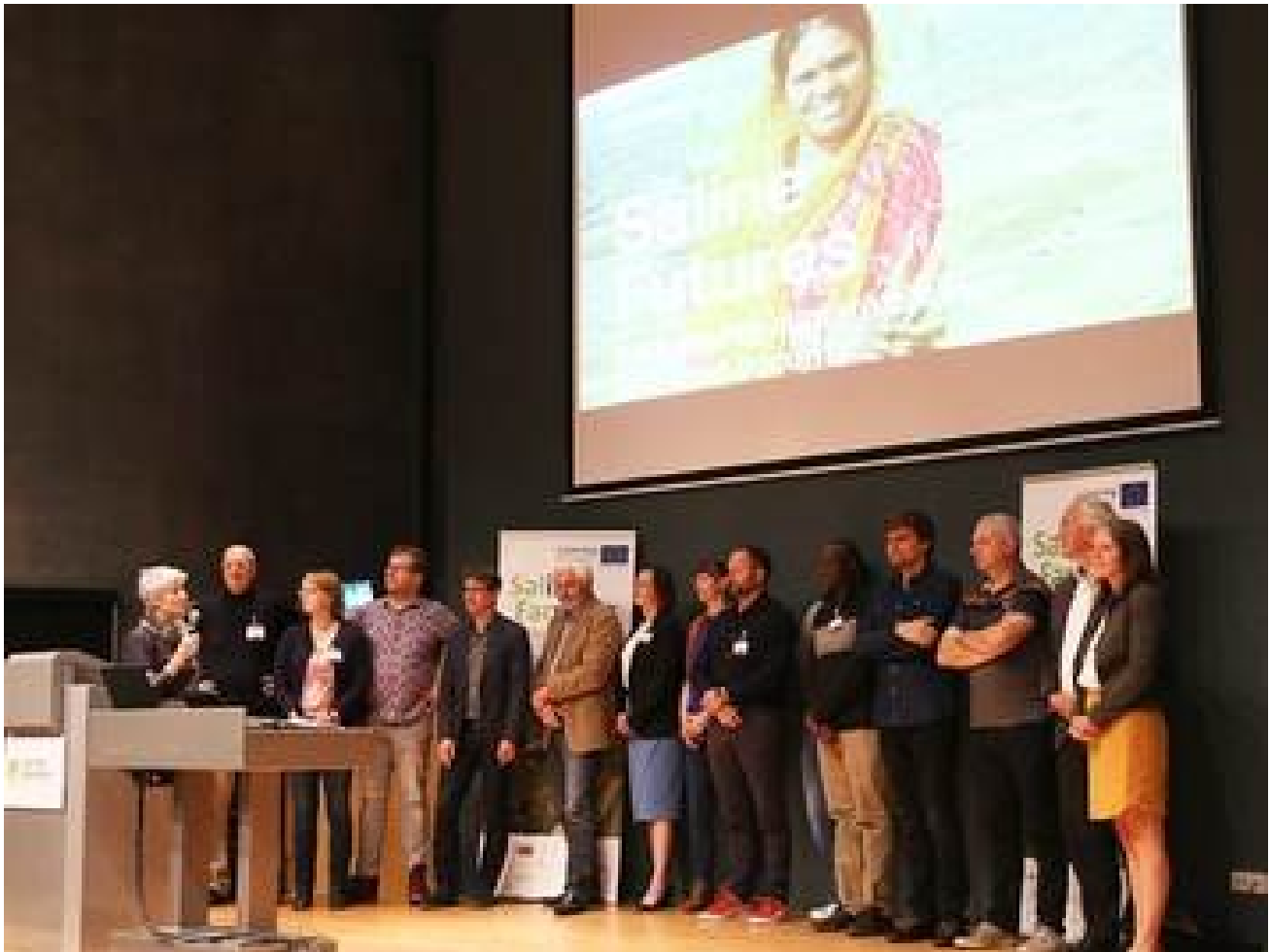
The SalFar team at the welcome session of the conference