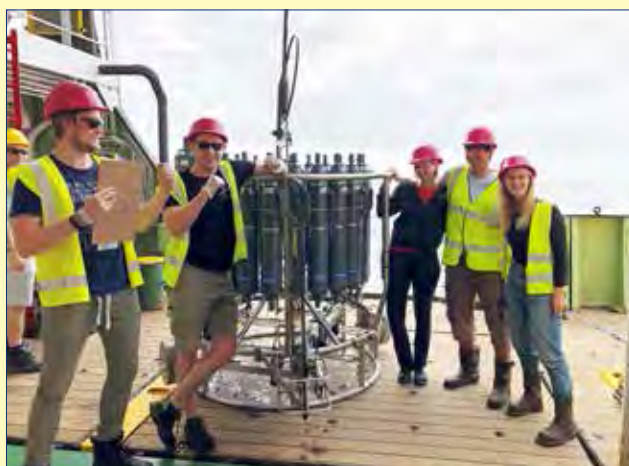
Successful retrieval of the deepest CTD cast deployed by the night shift (6455 m)

Two systems were used to measure p\text{CO}_2 , a VLIZ custom-made system and another system based on detection of non-dispersive infrared light (NDIR). For more details of these systems, and of the system used to measure total alkalinity, see the blogpost published during the expedition ( https://projects.noc.ac.uk/class-project/blog/nightshift-jc191 ). The graphs (right) show preliminary total alkalinity and p\text{CO}_2 data from the cruise.