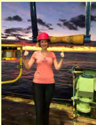
The end of a successful day!

Back in November 2019 I applied for a CLASS Fellowship to install and operate underway systems – systems that use seawater pumped onboard as the ship is in motion – to measure p\text{CO}_2 (effectively the concentration of dissolved \text{CO}_2 ) and total alkalinity from the RRS James Cook during the CLASS GO-SHIP expedition from Florida to Tenerife (JC191). The setup on the vessel and the capacity to compare the underway systems with conventional analytical methodologies, allowed their performance to be optimised. At the same time, the work allowed me to improve my personal understanding of the biogeochemical processes around carbonate chemistry and carbon fluxes (air–sea, surface water–deeper water) in the area, and in the open ocean in general.