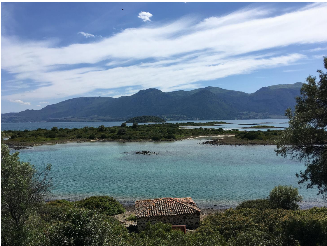
Figure 2. Lichadonisia panorama: photo taken from Monolia, with an abandoned building by the sea, Kokkinonisi in the front, and Strongyli at the end. In the background, the mountains of mainland Greece appear.