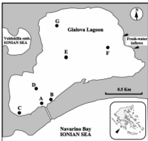
Fig. 1. – Map of Gialova lagoon indicating the seasonal sampling stations for molluscan community analysis.

Gialova lagoon is a poly-hyperaline basin in SW Greece and lies between Navarino bay and Voidokilia embayment adjacent to the Ionian Sea (Eastern Mediterranean) (Fig. 1). It covers an area of 2.5 km 2 , with a maximum depth of one metre and is connected with the adjoining Navarino bay via a small channel (100m long, 10m wide and 1.2m deep). Fluvial input is by two small inlets to the eastern part of the lagoon. Generally the sediment is muddy-sand, being covered in most areas with green algae and the eel grass Cymodocea nodosa . In small parts of the lagoon mud is mixed with dead shells of the bivalve Cerastoderma glaucum .