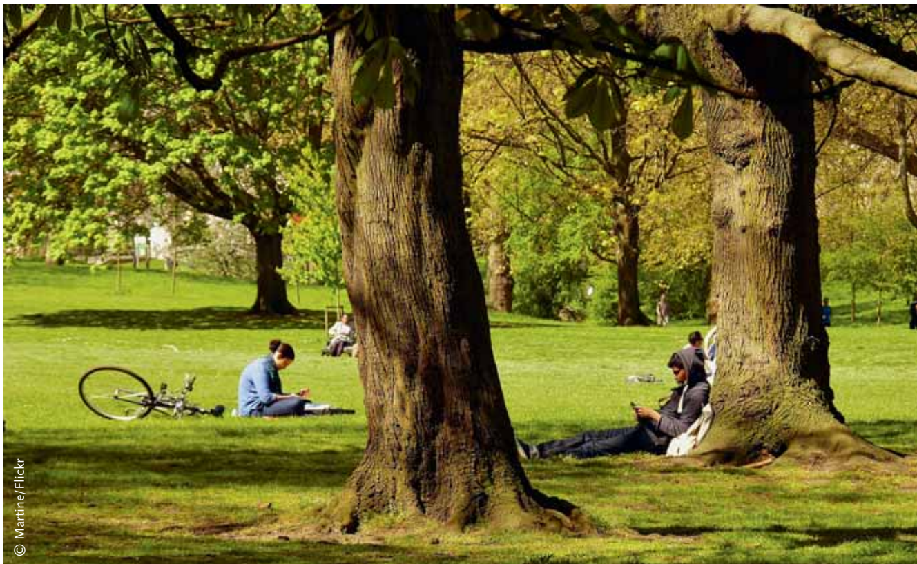
FIGURE 2: Nature-based solution approaches can promote the development and management of urban ecosystems to offer sustainable and cost-effective solutions to societal challenges like global warming, water regulation and human health, while enhancing biodiversity. Here, the Green Park in London.