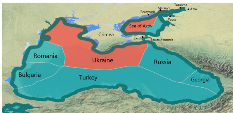
Map 2. The Black Sea, including the internal waters, alleged territorial sea, and EEZ of Ukraine.