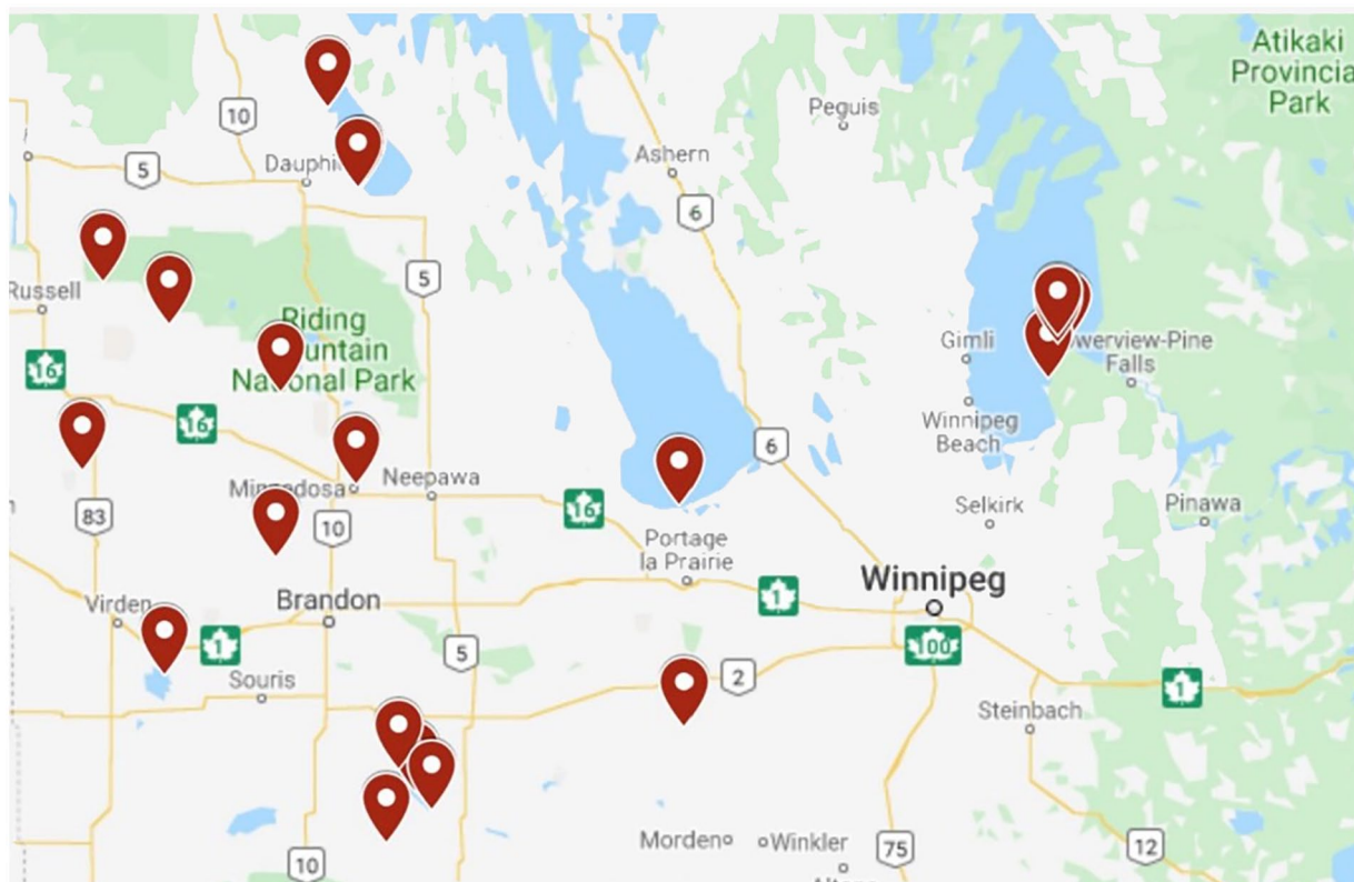
Figure 1. Screenshot of publicly-available map of HABs occurrence across Manitoba in 2019. 73,75

(DH), the responsible organization in association with local health advisors. 42,76