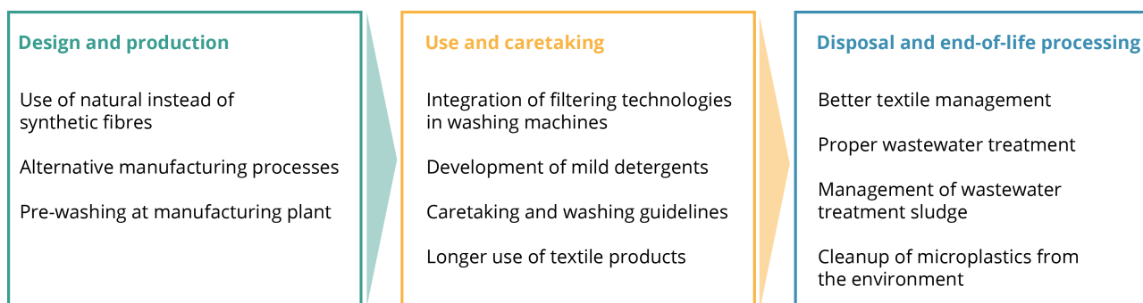
Figure 3. Pathways to prevent the release of microfibres from textiles

microfibre release from textiles: (1) sustainable design and production; (2) caretaking measures to control microplastic emissions during use; and (3) improved disposal and end-of-life processing. These pathways are illustrated in Figure 3.