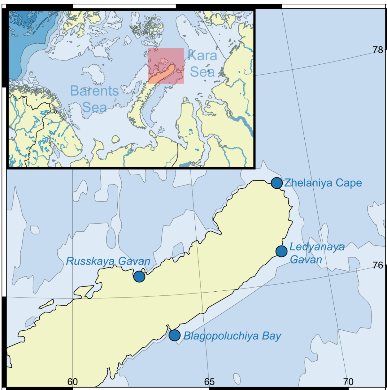
Figure 1. Map of studied areas off Novaya Zemlya.

The northern part of Novaya Zemlya remains one of the least studied areas of the Barents Sea. In particular, information about the shallow-water mollusk fauna is still represented only by findings of two species by the Norwegian expedition of 1921 (Grieg 1924; Nekhaev & Krol 2017). The fauna of the open sea areas off the northern coast of the archipelago is described better and is represented by species common for Arctic (Frolova et al. 2011; Nekhaev & Krol 2017; Zimina et al. 2017).