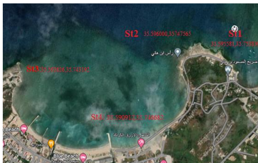
Figure 1: locations of the studied stations and their geographical distribution

Figure (1) shows the locations of the studied stations and their geographical distribution.