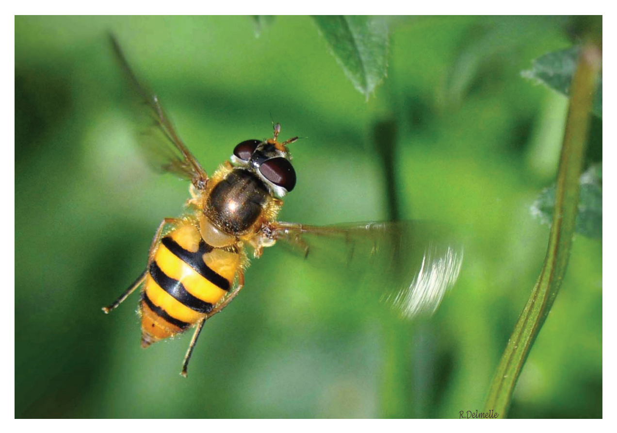
Fig. 2. Epistrophe flava Doczkal & Schmid, 1994, an endangered species.