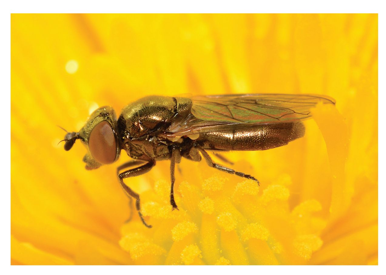
Fig. 3. Lejogaster metallina (Fabricius, 1781), an endangered species.