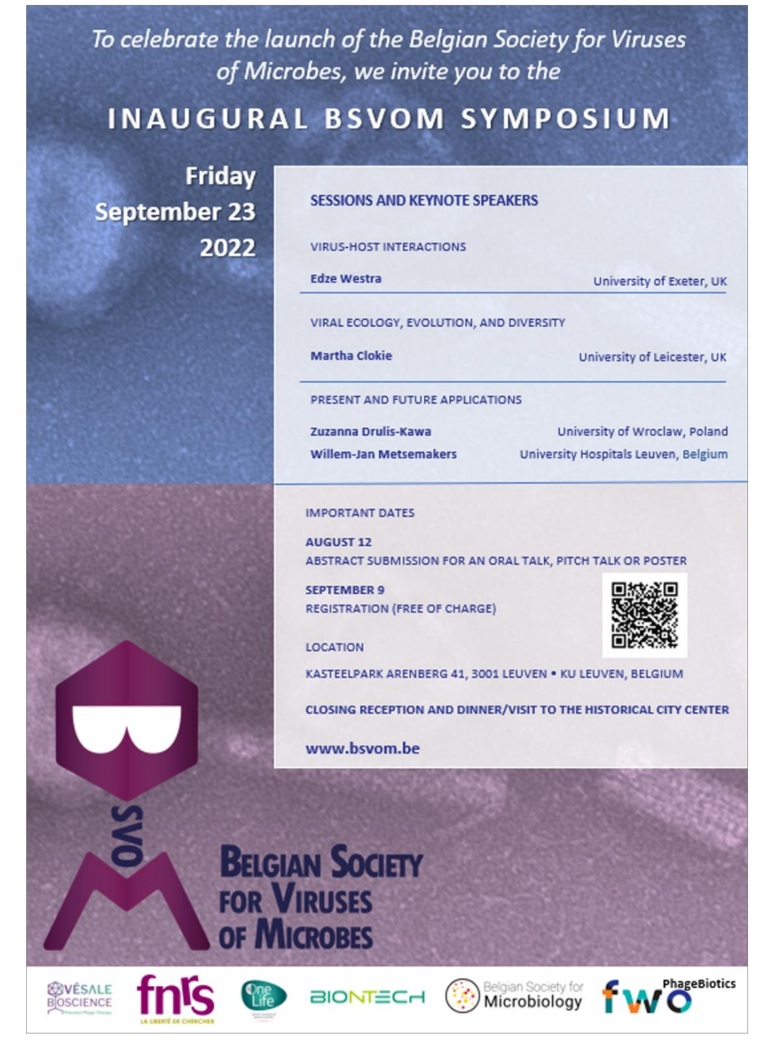
Figure 3. Flyer advertising the inaugural BSVoM symposium.