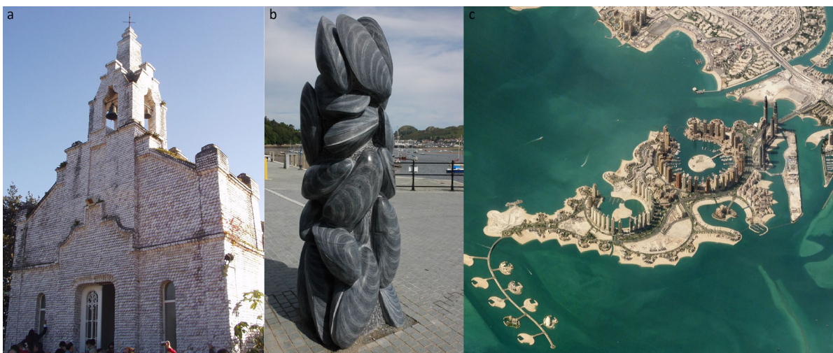
Figure 1 Examples of shellfish used in spiritual, emblematic or cultural contexts. (a) The shell church, covered in scallop shells at La Toja, Spain; (b) Sculpture of mussels in the mussel producing town of Conwy, Wales, UK; (c) Coastal development designed in the shape of an oyster: The Pearl, Qatar.

Bivalves have an archaeological and historical value, with empty shells found in midden piles which have been dated to between 8,000 and 7,000 years (Rollins et al. 1987; Roosevelt et al. 1991). Among the indigenous peoples of the Americas who lived on the eastern coast, they commonly used pieces of shell as wampum (small cylindrical beads strung together). The shells were cut, rolled, polished and drilled before being strung together and used for personal, social and ceremonial purposes as well as currency (Dubin 1999). The Winnebago tribe from Wisconsin had numerous uses for mussels, using them as utensils and tools. They notched them to create knives and graters and carved them into fish hooks and lures as well as powdering shell into