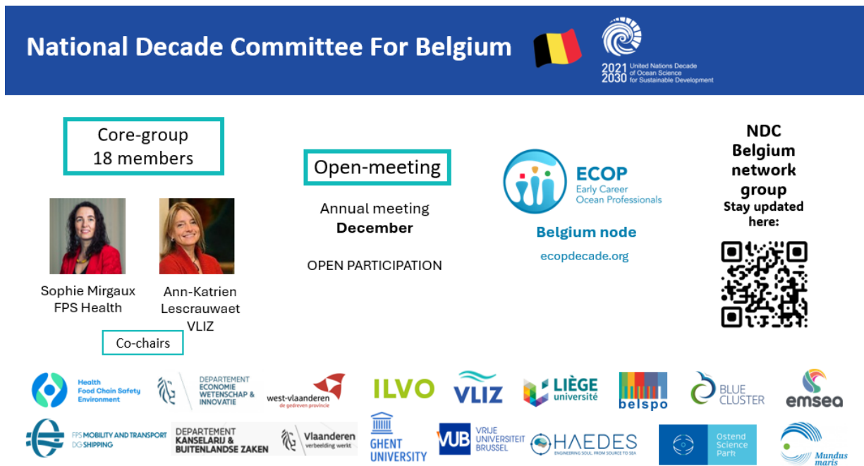
Figure 1: Organization of the NDC-BE with core group and open meeting

Flanders Marine Institute (VLIZ) is given mandate to provide secretariat support to the NDC-BE. VLIZ supports the secretariat with a 1FTE programme specialist (also covering the Ocean Decade secretariat for Flanders) and a part-time dedicated specialist in International Relations. The NDC-BE is supported by 18 active members, representing the diversity of ocean actors and stakeholders in Belgium.